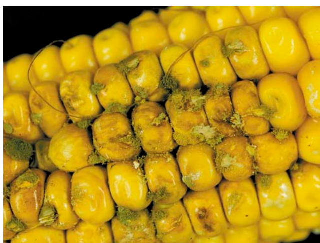
Figure 2. Aspergillus flavus spores on damaged corn kernels.