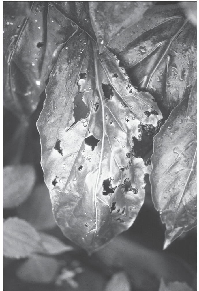
Figure 1. Bacterial spot symptoms on pepper leaves.

survive on dried seeds for up to 10 years. It is not able to survive free in soil for a long time, but can survive up to 6 months in infected crop debris in soil. The bacterium penetrates leaves through stomata and/or wounds, and fruits through wounds created by wind-driven sand, insect punctures, or mechanical injury. Dissemination of the bacterium occurs between and