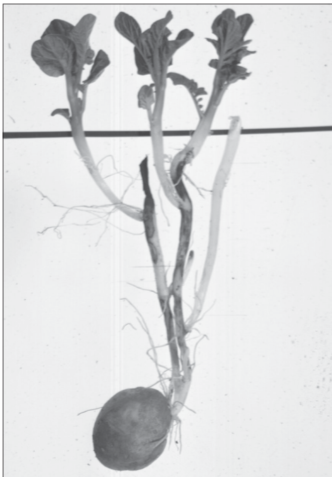
Figure 2. Brown, sunken Rhizoctonia stem cankers on newly sprouted seed tuber (black line represents the soil surface). Note that one sprout was killed before it could emerge.