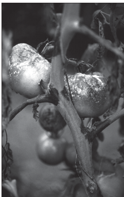
Figure 3. Tomato fruit with late blight have large, firm, brown, leathery-appearing lesions and may show a cottony, white mold growth.

(but not black) nightshade. Since 1990, there have been severe outbreaks of late blight in commercial and home garden plantings of potato and tomato in both the U.S. and Canada. Much of this has been associated with new strains of the late blight fungus that have spread to many areas. Some of these strains may interact and form a type of resistant spore that can survive for long periods in soil. Others are insensitive to a systemic fungicide (metalaxyl) that has been widely used in late blight management. The protectant fungicides commonly used to protect plants from late blight remain fully effective with all known strains of the fungus.