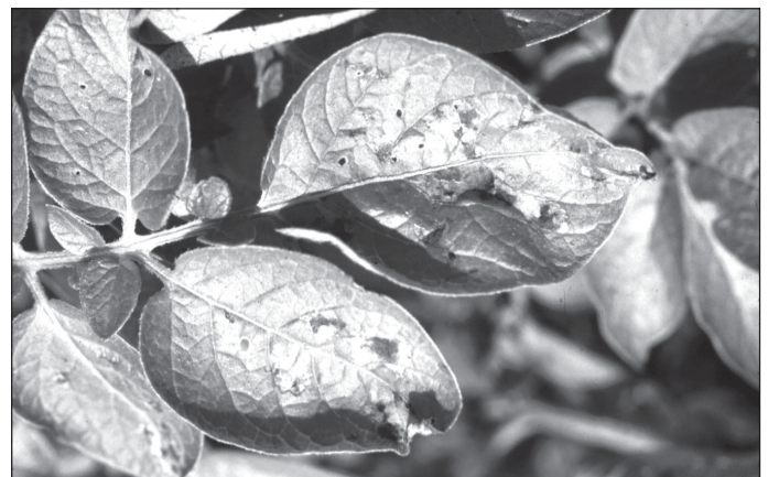
Figure 1. Irregular, purplish-black late blight lesions on leaves of potato.

Besides potatoes and tomatoes, P. infestans can infect only a few other closely related plants. Occasionally peppers and eggplants are mildly infected, as are a few related weeds such as hairy