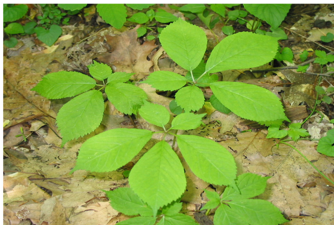
Figure 1. American ginseng (Panax quinquefolium) is the only ginseng native to North America. Future mention of ginseng in this fact sheet will be referring to American ginseng.

Before you attempt to grow American ginseng, it is important to understand the site conditions under which American ginseng typically thrives in the wild. Naturally occurring American ginseng has been found on a variety of sites; however, typically it is found on shady, rich, moist but well drained sites. The purpose of this fact sheet is to provide you with information that will help you to select a site where you are most likely to be successful at growing American Ginseng.