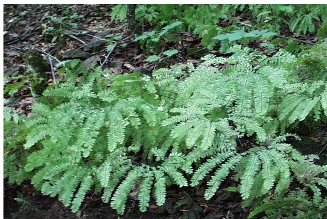
Figure 4. Maidenhair Fern is another example of an understory plant that may indicate a good ginseng site.