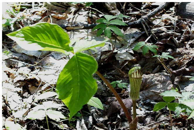
Figure 3. Jack-in-the-pulpit is an example of an understory plant that may indicate a good ginseng site.

edges that are usually less suitable for ginseng production. Other understory plants that are often indicators of good ginseng sites include jack-in-the-pulpit, bloodroot, wild ginger, blue and black cohosh, trilliums, Solomon's seal, various ferns (particularly maidenhair fern), ramps, and goldenseal.