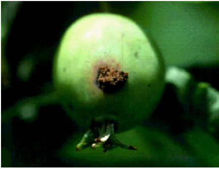
Figure 2: Frass from codling moth on apple.

Insecticides can be limited and treatments better timed by using pheromone traps. These specialized traps are baited with the sex attractant of the female codling moth. The traps capture male moths and give an estimation of when mating and egg-laying take place. The first insecticide application is often optimal about three weeks after the first consistent captures of male moths. The traps also can give some estimation of how many insects are present. It has been suggested that for backyard orchards, there is little benefit from treatment if trap captures are less than five per week. In some of the Western Slope fruit-producing counties, codling moth and other fruit insects are routinely monitored. Information on their activity is made available through codaphone messages and other media by Colorado State University Cooperative Extension county offices and regional Experiment Stations.