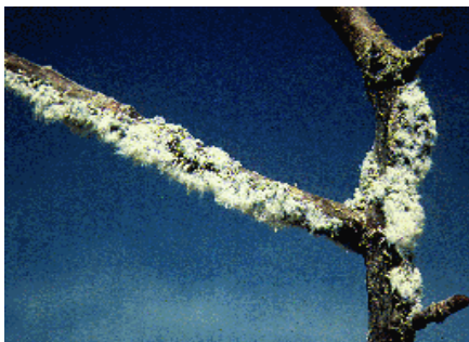
Figure 5: Woolly apple aphid on stem.

Apple maggots spend the winter in the pupal stage around the base of apple trees. The adult flies emerge in midsummer, typically between mid-July and early August, and lay eggs on the fruit. There is only one generation per year.