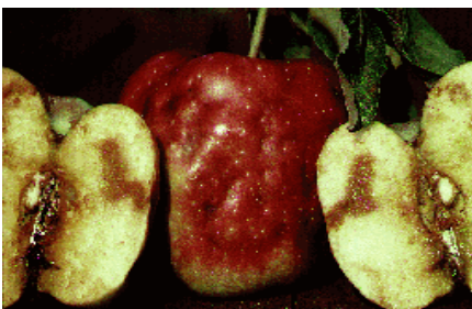
Figure 4: Apple maggot injury to apple.

Pear psylla problems are greatly lessened in unsprayed orchards, where they are heavily attacked by parasites.