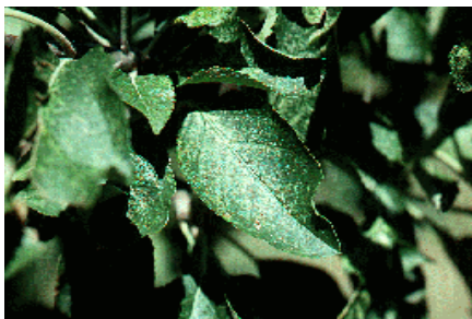
Figure 6: White apple leafhopper injury to foliage.

Problems with catfacing insects are of little concern to home orchardists, because the fruit remains in generally good condition despite the scarring. Occasionally, more severe problems occur when orchards are next to alfalfa fields. Alfalfa is a common host plant for catfacing insects such as the lygus bugs, which migrate in large numbers following harvest.