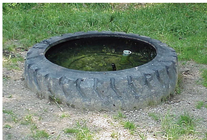
Heavy Equipment Tire as Water Trough.

A trough or tank should be made of materials that can be expected to remain functional for a number of years (10 minimum). Concrete tanks and heavy equipment tires are popular choices that will render many years of service when developing watering areas. Automatic water level control and/or an overflow should be provided in all tanks. Overflow pipe may range in size from 1-1/4 inch plastic to 4 inch polyvinyl chloride (PVC) pipe, but overflow water must be piped in a desirable direction for release to reduce erosion or creating a wet spot in the field. The top of the overflow pipe should be adjusted to allow approximately 2 inches from the water surface to the top of the tank. Any valves