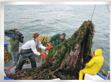
Staff and volunteers remove debris from sanctuary waters.