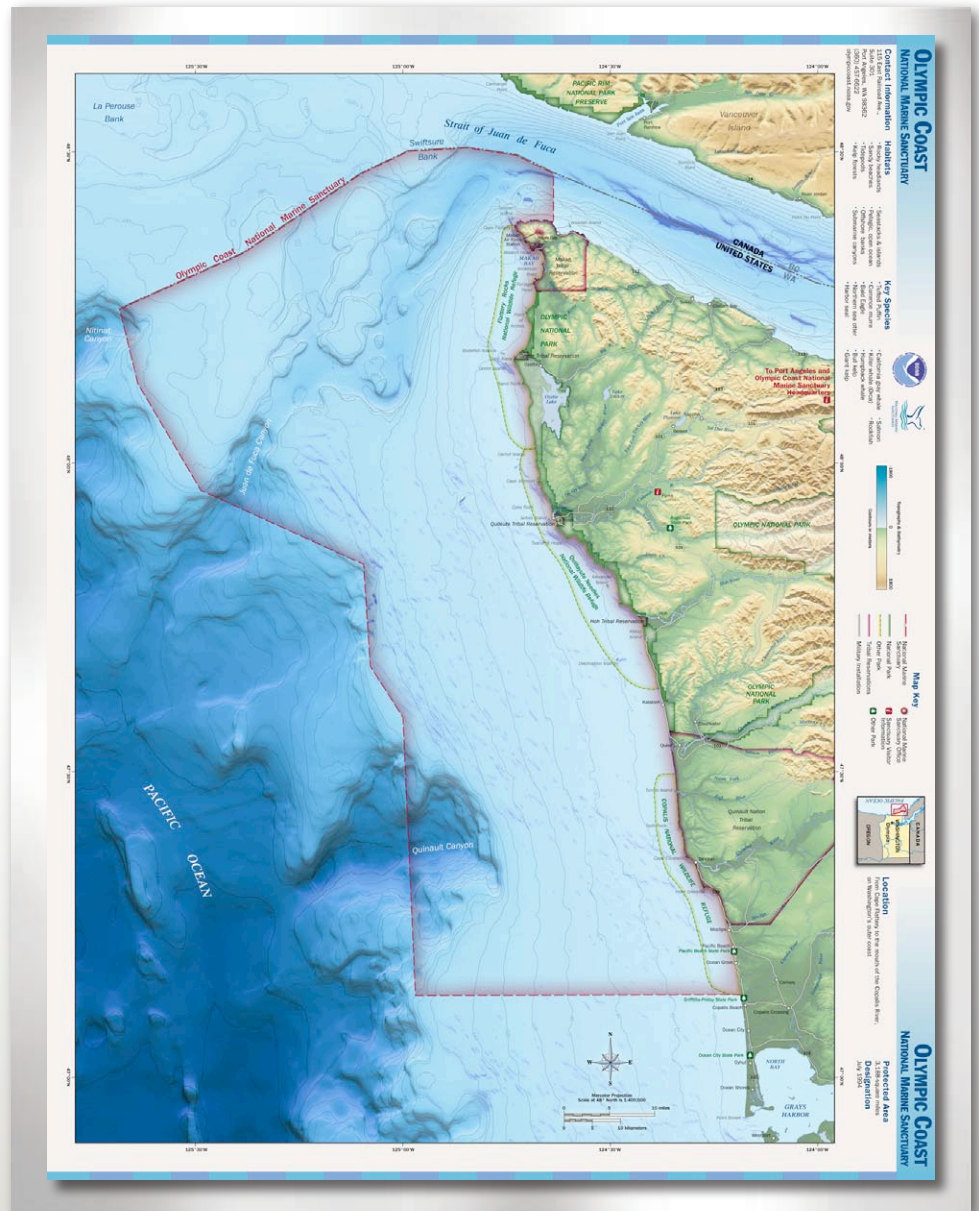
Sanctuary maps available at sanctuaries.noaa.gov

For the eighth straight year, sanctuary staff partnered with Olympic National Park, Olympic Coast Alliance, Surfrider Foundation and others to mobilize volunteers to remove over 15 tons of debris from sanctuary beaches. Building on that experience, the sanctuary, with funding from NOAA's Marine Debris Program, led development of a long-term plan for removal of marine debris on wilderness beaches. The plan formalizes commitments from cleanup partners and improves the effectiveness of the volunteer cleanup effort. Works also continued with the Northwest Straits Commission and the Makah Tribe to survey and recover lost nets and crab pots, reducing their deadly toll on marine wildlife.