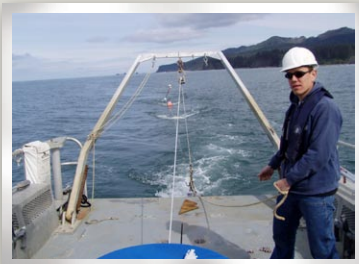
A researcher deploys instruments used for hypoxia monitoring.