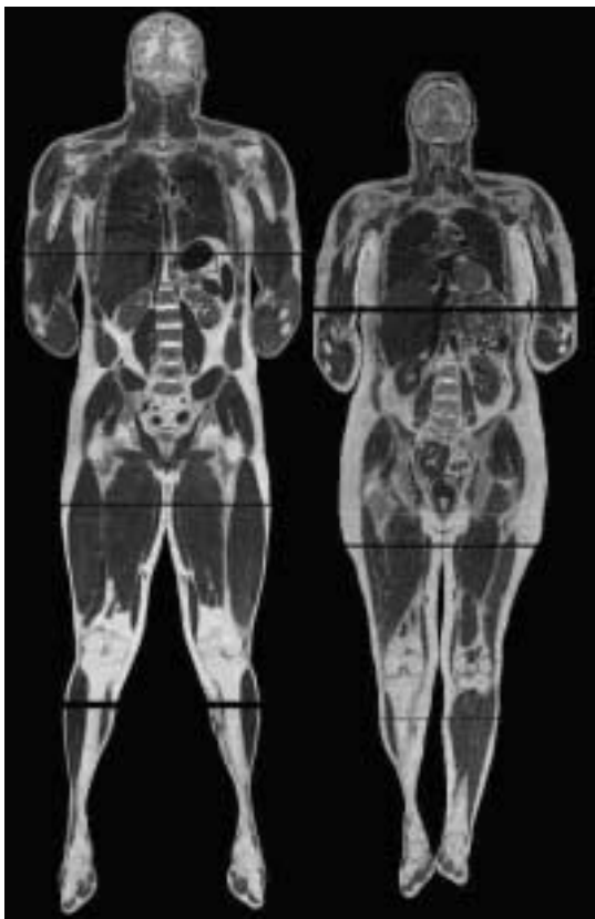
Figure 1 – Visible Human Male and Female

The details of how the images which make up the Visible Human data sets, figure 1, were captured are described elsewhere [2]. The male data set contains 1871 digital axial anatomical images obtained at 1.0 mm intervals and is 15 gigabytes in size. The female data set contains 5189 digital axial anatomical images obtained at 0.33 mm intervals and is 39 gigabytes in size.