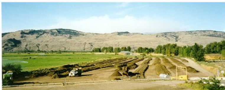
Plate 1. Picture of a typical on-farm composting operation. This producer composts a range of crop residues (straw and spoiled grain), poultry manure and sawdust / shavings bedding materials.

A diagram of the inputs and outputs of a composting process can be seen in Plate 2 over page.