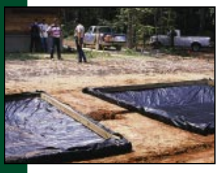
Construction of the ETPMC's wetlands included two lined cells.

Micro-wetlands are an alternative treatment where standard septic systems are not suitable. They are constructed by excavating shallow earthen ponds which may be lined and filled with media such as river rock or chipped rubber tires. A typical micro-wetlands