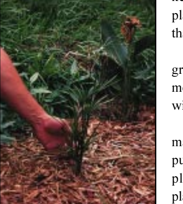
A bed of mulch should be placed around plants to reduce weeds in the system.

stemmed plants require less maintenance than soft-stemmed plants. Attention should also be given to a plant's time of flowering and dormancy, along with response to sunlight exposure. For example, cannas, which are soft-stemmed plants, are highly invasive and dormant in the winter. Their dried brown leaves may need to be removed in the spring. To make pruning easier,