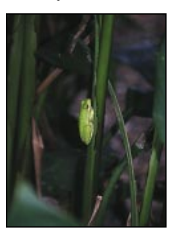
A wetlands soon becomes a complete ecosystem with insects, frogs and butterflies.

transport water out of the system by evapo-transpiration.