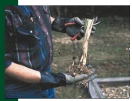
Plants must be installed at the depth they were originally planted, which is determined by a change in color on the stalk.

To get the optimum plant design, first place colored flags in the media for each plant according to a desired pattern. Plants should be spaced from two to three feet apart in all directions.