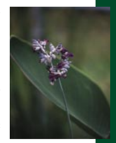
The hard-stemmed Thalia, has a beautiful purple flower that blooms in the spring.

In the second zone or the back of the wetlands, nutrient are reduced. Flowering, soft-stemmed, nutrient-tolerant plants work best in this section. These plants