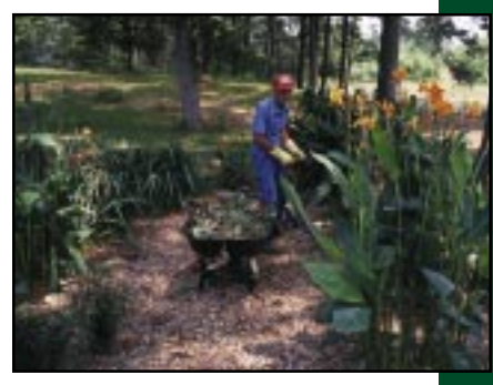
Cannas are soft-stemmed high-maintenance plants that may need to be pruned each spring.

Besides state regulatory maintenance requirements, a homeowner can expect to spend some time weeding and trimming plants to maintain the desired beauty of the wetlands. The amount of maintenance required is largely determined by the type of plants installed in the wetlands. As a rule, hard-