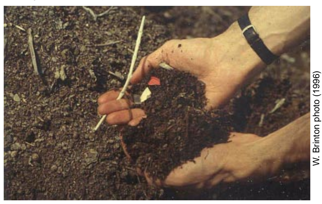
Fig. 2 - MSW Compost in French Vineyard - Lack of quality control led to a high percentages of physical contamination visible at end-user sites. Compost in photo contained plastic, glass, rubber and leather.