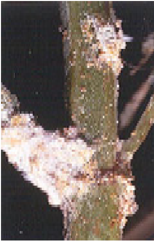
Figure 3. Citrus mealybugs on coleus.

days. The newly emerged insects, known as crawlers, move about the plant. Oftentimes, infestation of new plants occur during this movement. Mealybugs mature in approximately two months.