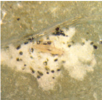
Figure 11. Thrips and associated damage.