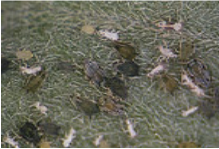
Figure 10. Chrysanthemum aphids.