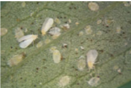
Figure 1. Greenhouse whitefly adult and nymphs.

Greenhouse whitefly ( Trialeurodes vaporariorum ) is a common pest of several houseplants such as poinsettia, ivy, Hibiscus , and Lantana . Greenhouse-grown vegetables, such as tomatoes and cucumbers, are also frequently infested. Damage is caused from the insects sucking sap from the plant. Heavily infested plants may drop leaves prematurely and have reduced vigor. During feeding, whiteflies also excrete sticky honeydew that detracts from the appearance of the plant.