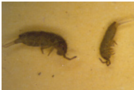
Figure 16. Springtails.

around windows. Fungus gnats cause little or no injury to house plants but create a serious nuisance problem. Problems are most common during winter and early spring. Since these insects develop in potting soil, virtually any houseplant can be a host for fungus gnats.