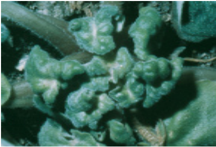
Figure 6. Cyclamen mite damage to African violet.

Much less commonly found are the cyclamen mite and the broad mite (Family Tarsonemidae). Both are extremely tiny and do not make the webbing characteristic of spider mites. Instead, the presence of these mites is usually suspected from the plant symptoms that they produce. Cyclamen mite often cause new growth to be stunted, twisted, and sometimes killed back. Leaves may also appear small, thick, and rough textured. African violet is the houseplant most often damaged by cyclamen mite. Broad mite produces a bronzing of the leaf underside on plants such as citrus and begonias.