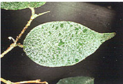
Figure 8. Honeydew produced by brown soft scale.

Crawler stages are susceptible to most houseplant insecticides. However, insecticides must maintain coverage throughout an entire generation of the insect (two to four months) to eliminate further infestation. Short persisting insecticides, such as pyrethrins and resmethrin, need reapplying at least once per week. Longer persisting treatments, such as bifenthrin and permethrin are effective for scale control when used at longer intervals. Soil applied systemic insecticide imidacloprid should be effective for most soft scale infestations.