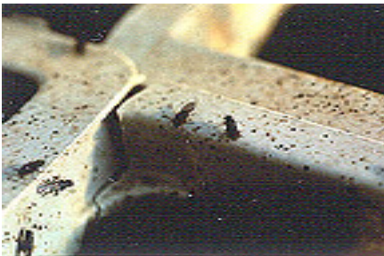
Figure 15. Shore flies and associated "fly specks".