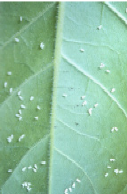
Figure 2. Greenhouse whitefly adults.

Insecticides containing pyrethrins or related insecticides (tetramethrin, resmethrin, sumithrin) are the most effective chemical controls for adult whiteflies. Horticultural oils, neem insecticides, and insecticidal soaps may control nymphs on leaves. The systemic insecticide imidacloprid is highly effective against greenhouse whitefly.