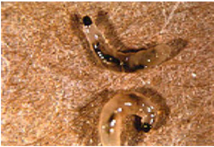
Figure 14. Fungus gnat larva.