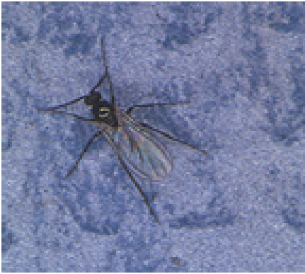
Figure 13. Fungus gnat adult.