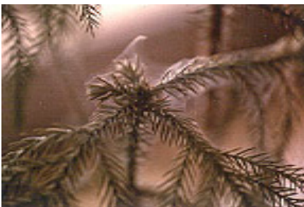
Figure 5. Spider mite webbing on Norfolk Island pine.