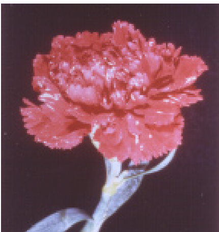
Figure 12. Thrips scarring of flowers.

period after egg hatch (crawler stage), are immobile. Horticultural oils are the most effective treatment for armored scales. Systemic insecticides provide poor control.