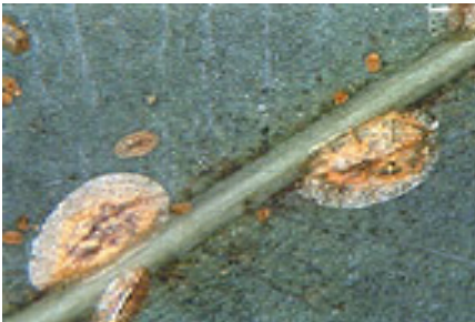
Figure 7. Brown soft scale.

Several scales, particularly the brown soft scale ( Coccus hesperidum ) and the hemispherical scale ( Saissetia coffeae ) may attack houseplants. These occur on many kinds of plants but problems are most frequent on ficus, citrus, ferns, and ivies. Heavy infestations of soft scales result in large amounts of sticky honeydew which can create serious nuisance problems. Sustained infestations can cause die back.