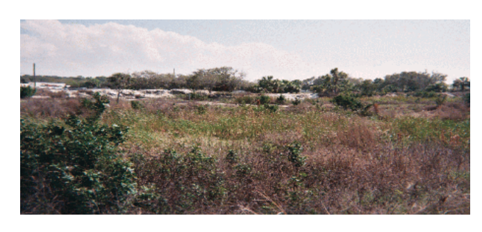
The South Parcel of the Stauffer Chemical Company Superfund Site (EPA OIG photo).

Under a consent decree, Stauffer is preparing a design for EPA-approved clean-up actions. In December 2007, the design was 30-percent complete. Region 4 had revised the community involvement plan for the site to include some community activity during the