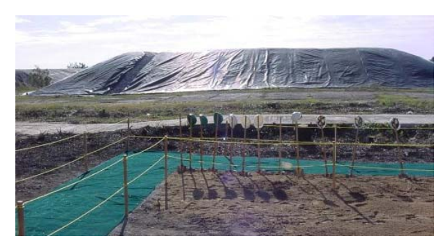
The contaminated soil mound contained within a high density polyethylene cap at the Escambia Treating Company Superfund site (EPA OIG photo).

In our follow-up review, we found that EPA and the U.S. Army Corps of Engineers monitored the housing inspection process, updated the Community Involvement Plan,