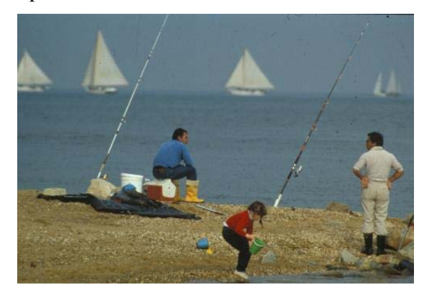
Sailing and fishing are popular recreational activities in the Chesapeake Bay.

Through its reporting, EPA could better advise Congress and the Chesapeake Bay community that (a) the Bay program is significantly short of its goals, and (b) partners need to make major changes if goals are to be met. Current efforts will not enable partners to meet their goal of restoring the Bay by 2010. Further, new challenges are emerging. Bay partners need to address: