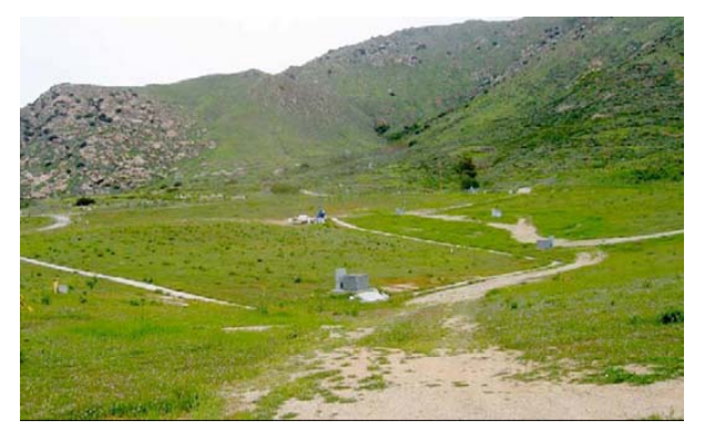
The northern former disposal area in Zone 1 for the Stringfellow Superfund site.

Superfund site had a high available balance of $117.8 million.