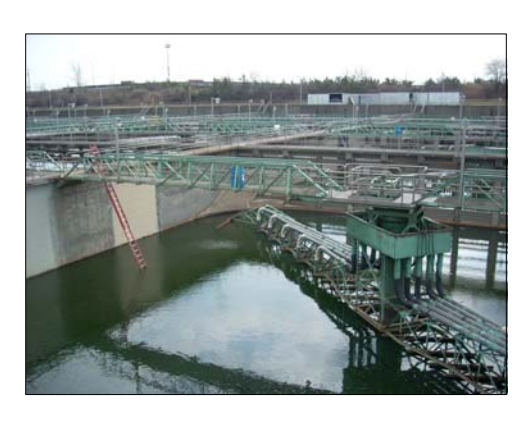
Final clarifiers and influent baffles that increase the capacity of the Passaic Valley Sewerage Commissioners plant in Newark, New Jersey.

• The Village of Wellsville, Ohio, did not meet federal requirements for financial management. In particular, the grantee did not have support for required matching costs and received grant funds it never expended. The grantee also made two improper procurements for engineering services, and did not maintain acceptable procurement or contract administration systems. We recommended that EPA Region 5 recover $1,241,591 in questioned costs, require the re-bidding of two engineering contracts, and classify the Village as a high-risk grantee until needed improvements are made. (Report No. 08-2-0204, Village of Wellsville, Ohio – Ineligible Costs Claimed Under EPA Grant XP97582801, July 21, 2008 – Report Cost: $134,457)