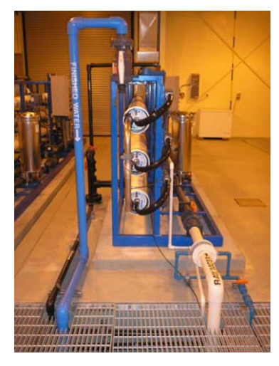
Nano-filtration system at a tribal drinking water facility.

Through a review of EPA records and independent OIG sample results, we determined that selected tribal drinking water supplies generally met regulatory requirements. However, internal control deficiencies existed in administering EPA's oversight of tribal community water systems in two of the five regions we reviewed.