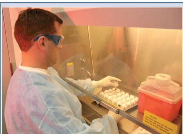
A technician in the Diagnostic Virology Laboratory inoculates eggs with a diagnostic sample.

As the reference laboratory for the NAHLN, NVSL will continue to support the growth of the Federal-State laboratory network over the years to come. Laboratory capacity for animal disease surveillance and emergency response will increase, focusing on improved geographic access to laboratory services and a broader number of diseases covered using common testing platforms.