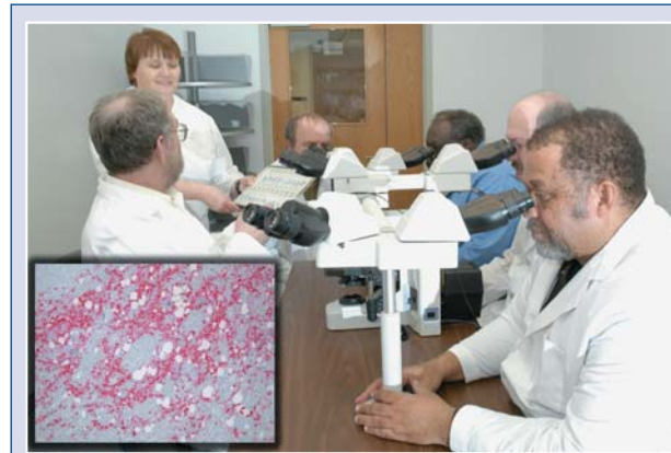
NVSL pathologists examine thousands of samples of brain tissue annually, looking for indications of the presence of bovine spongiform encephalopathy, or “mad cow disease,” in cattle that displayed signs of central nervous system illness at slaughter.