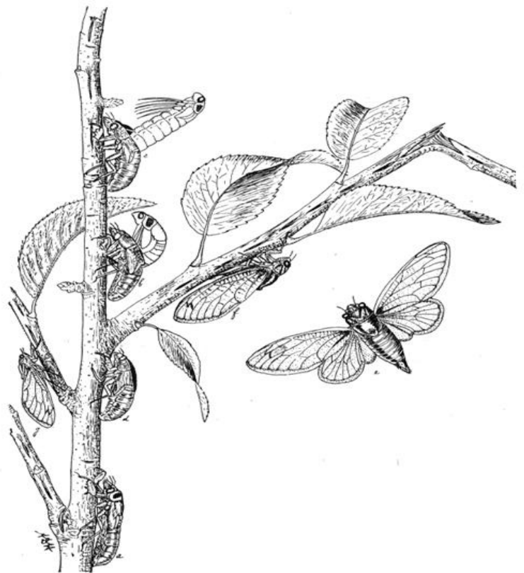
THE PERIODICAL CICADA, ( Cicada septendecim ). a. pupa; b. pupa with back split open and adult coming out; c. the same with adult almost out; d. empty pupa shell; e. adult wings spread; f. adult female in act of ovipositing; g. dwarf variety, showing comparative size. All about two-thirds natural sizes. (b and c after Riley.)

http://www.ento.psu.edu/extension/factsheets/periodical_cicada.htm