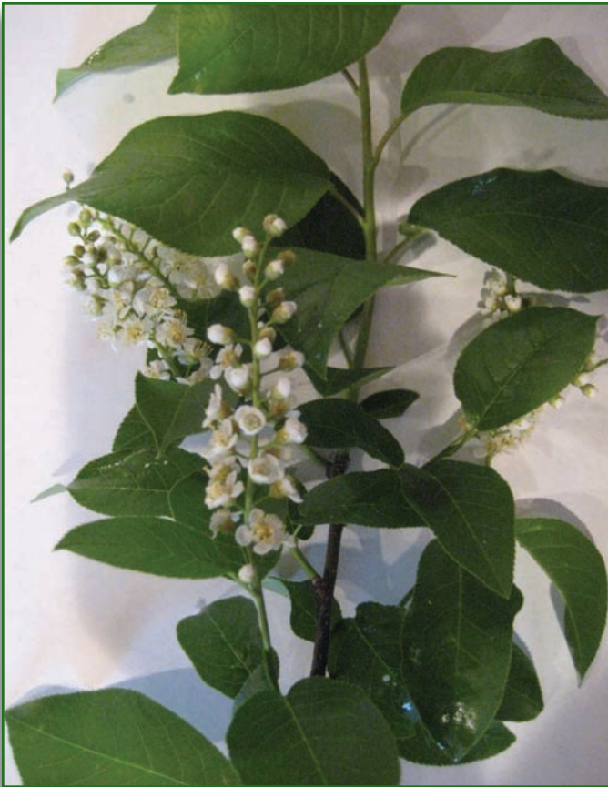
Chokecherry in bloom