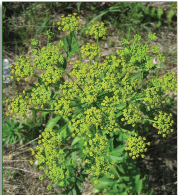
Close-up of flowers