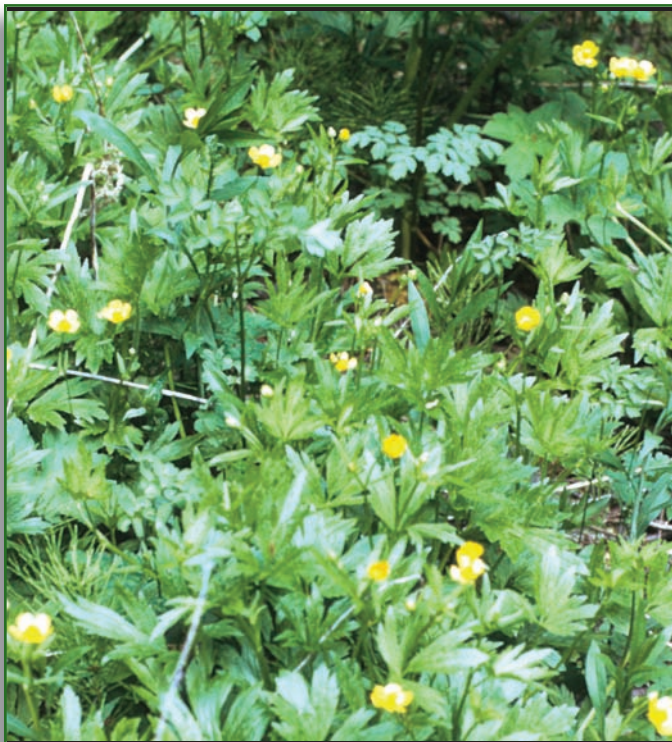
Tall buttercup in field