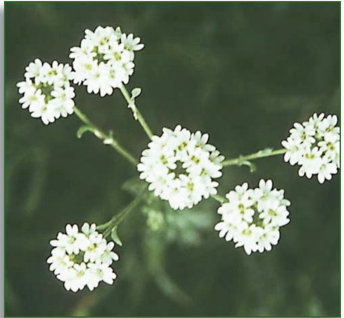
Hoary alyssum flower