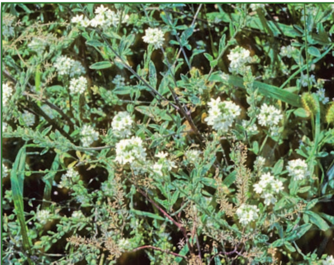
Hoary alyssum in a pasture