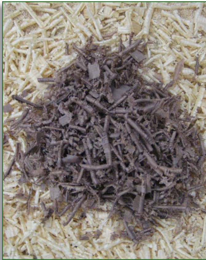
Dark black walnut shavings surrounded by lighter-colored pine shavings