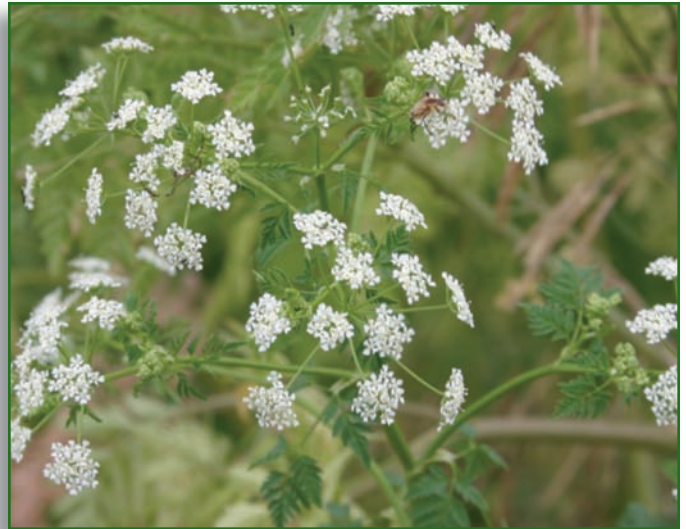
Poison hemlock flowers