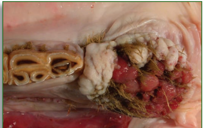
Ticklegrass embedded in a horse's mouth