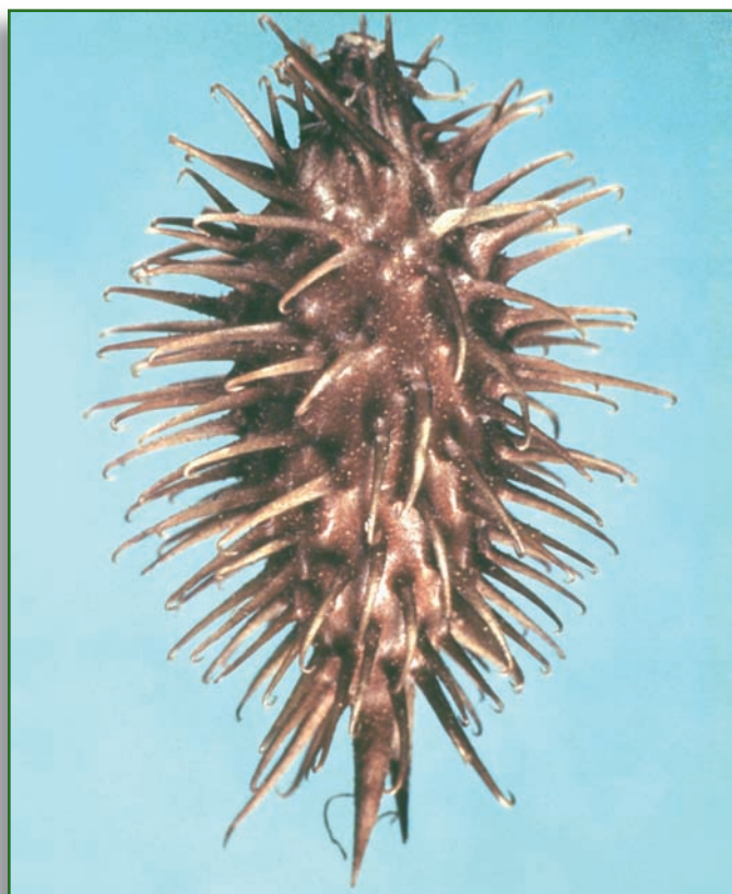
Common cocklebur bur