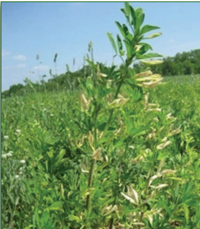
Frost injured alfalfa (note yellowing on leaves)