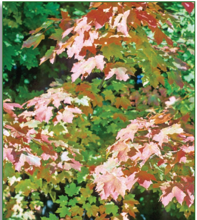
Fall maple leaf color