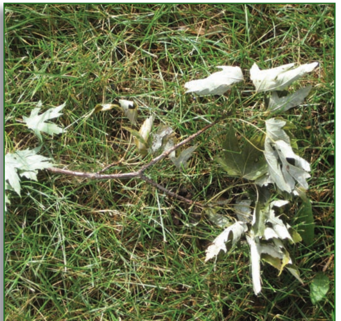
Wilted maple leaves in a horse pasture (wilting caused by storm damage)