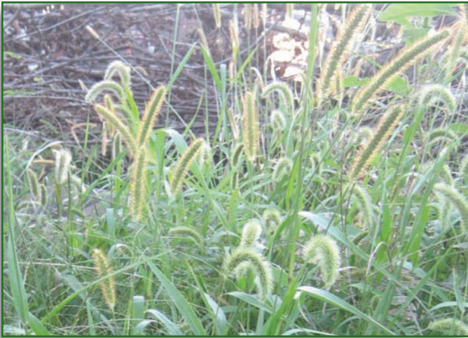
Foxtail with seed heads