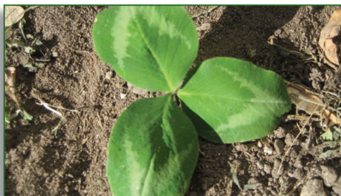
Red clover (showing "V" mark)