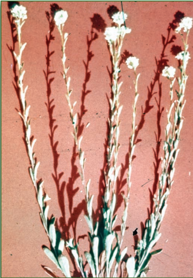
Mature hoary alyssum plant