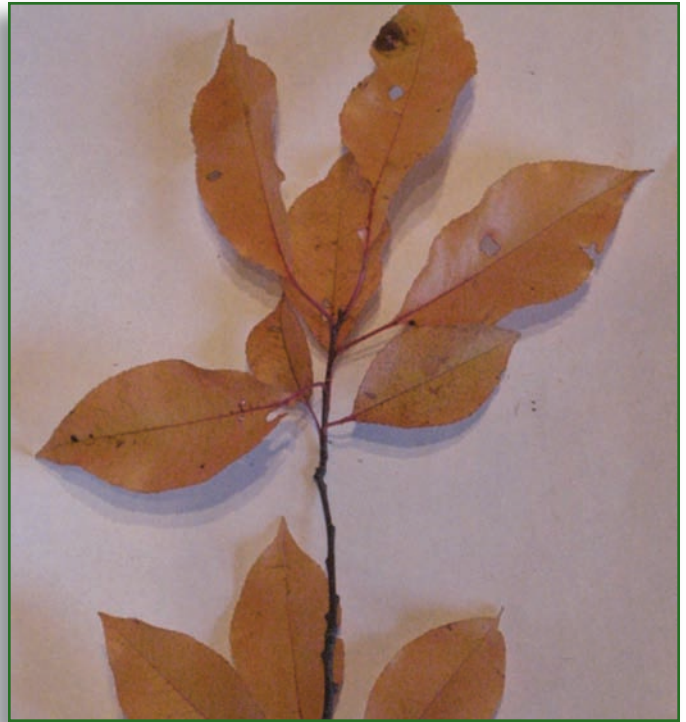
Fall colored cherry leaf