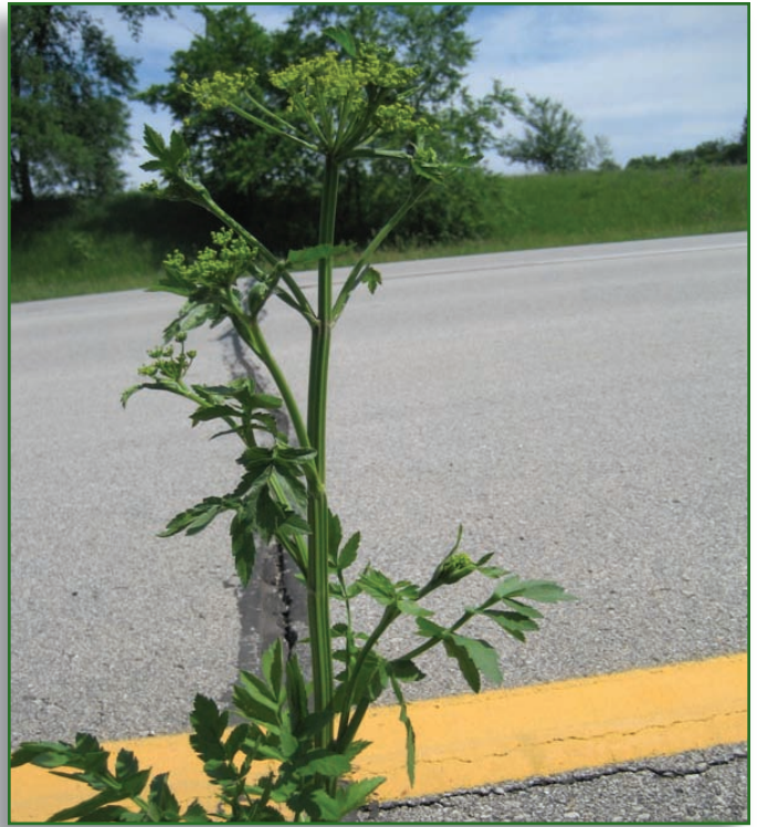
Wild parsnips along a roadside