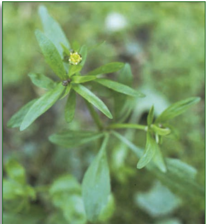
Close-up of smallflower buttercup flower