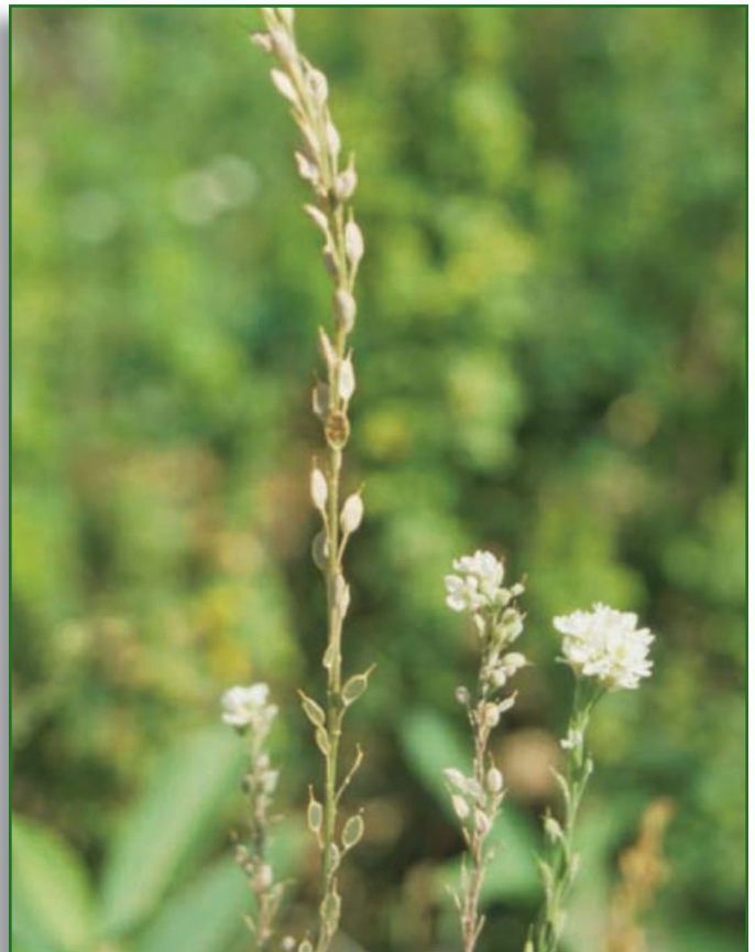
Hoary alyssum seed head