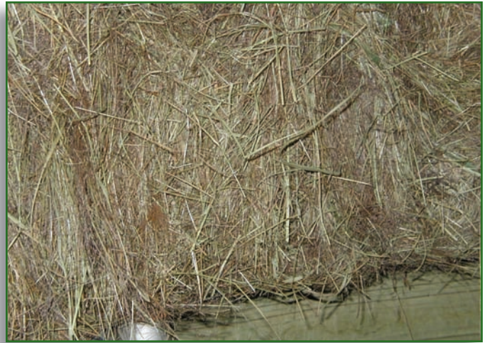
Hay containing a high percentage of ticklegrass (note dark or purple areas)