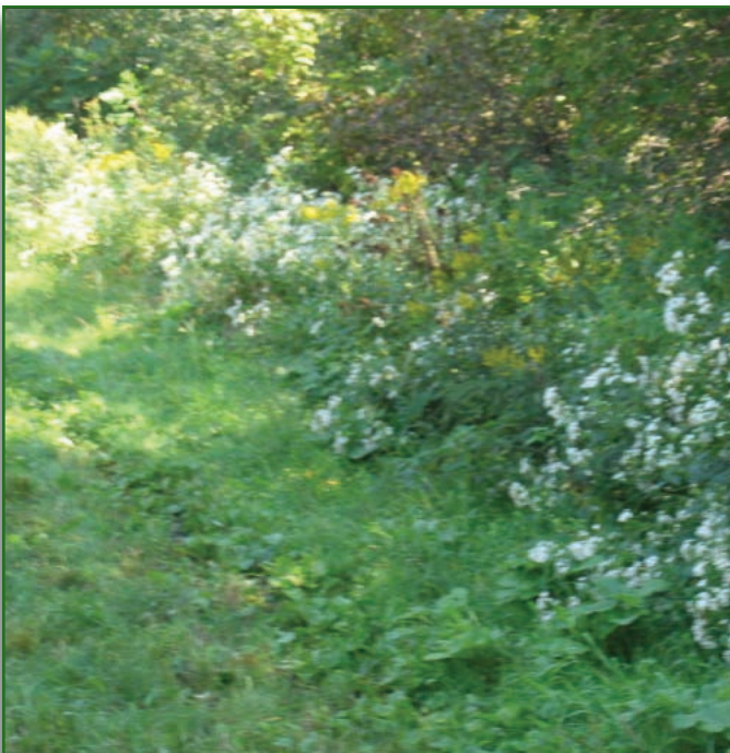
White snakeroot along a wooded edge