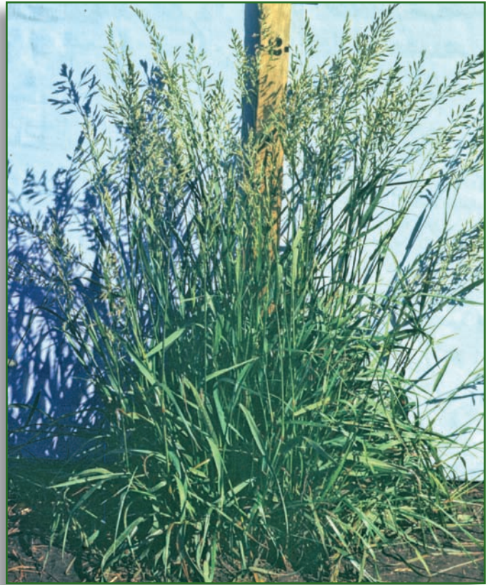
Mature tall fescue