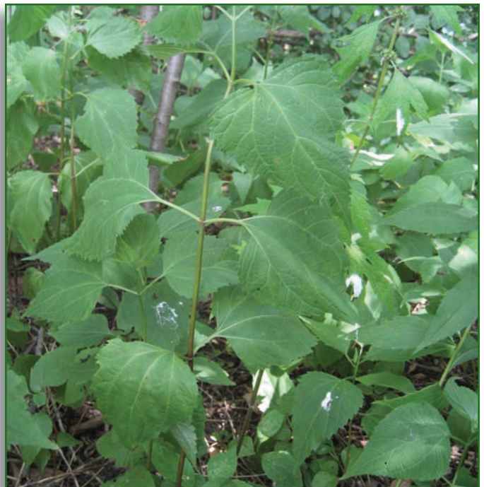
White snakeroot prior to flowering