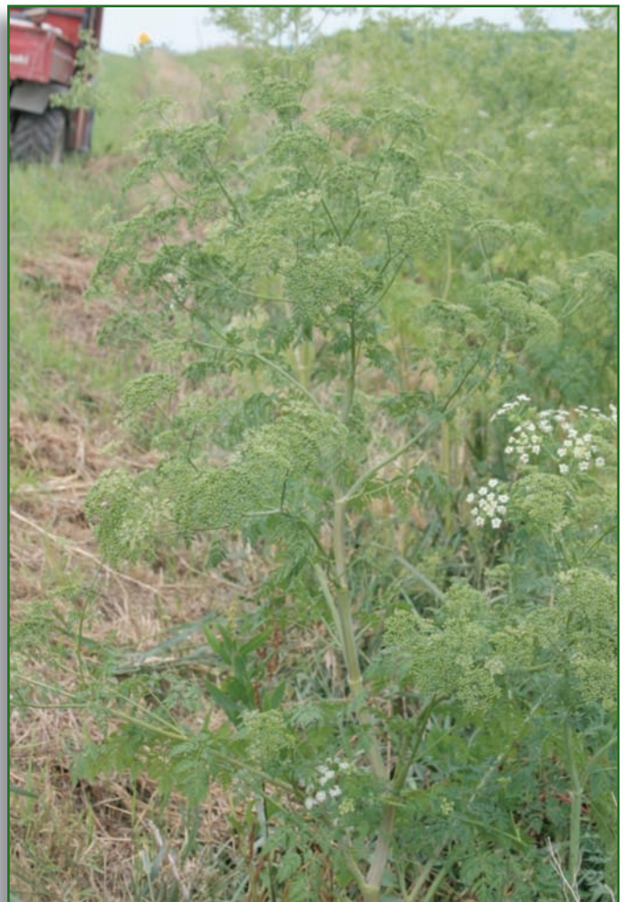
Poison hemlock mature plant