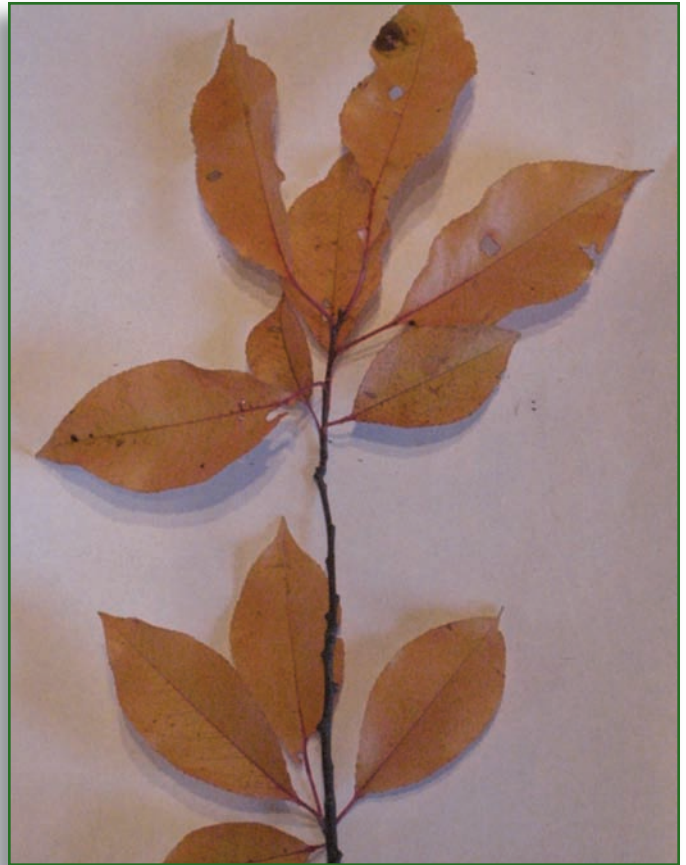
Fall leaf color of chokecherry