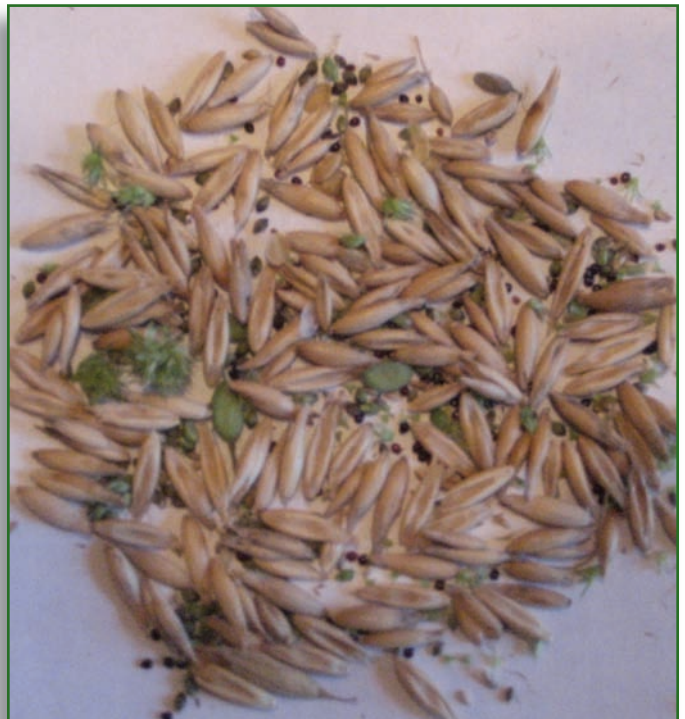
Weed seed contaminated oats