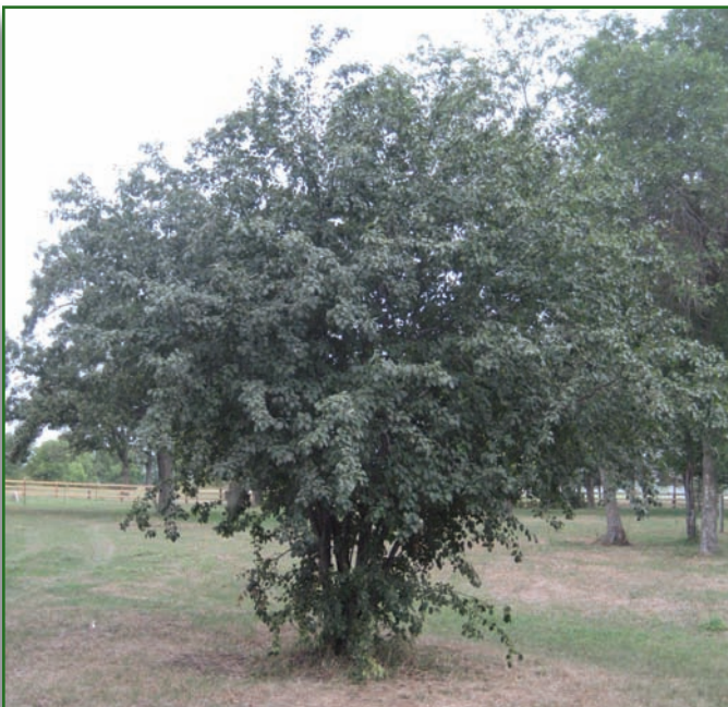
Mature chokecherry tree