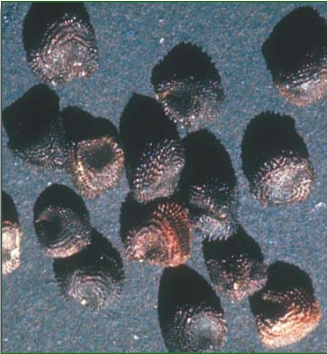
Corn cockle seeds