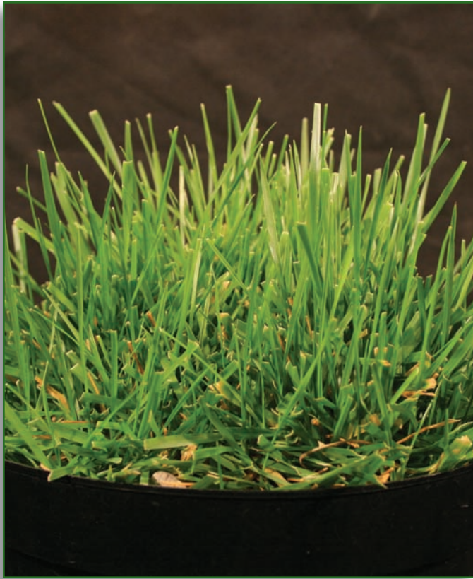
Vegetative tall fescue