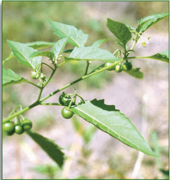
Eastern black nightshade berries