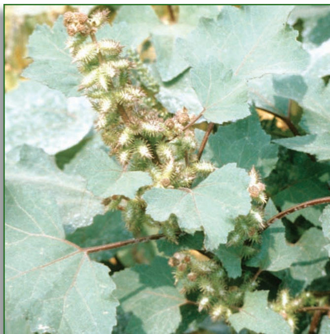
Close-up of mature plant