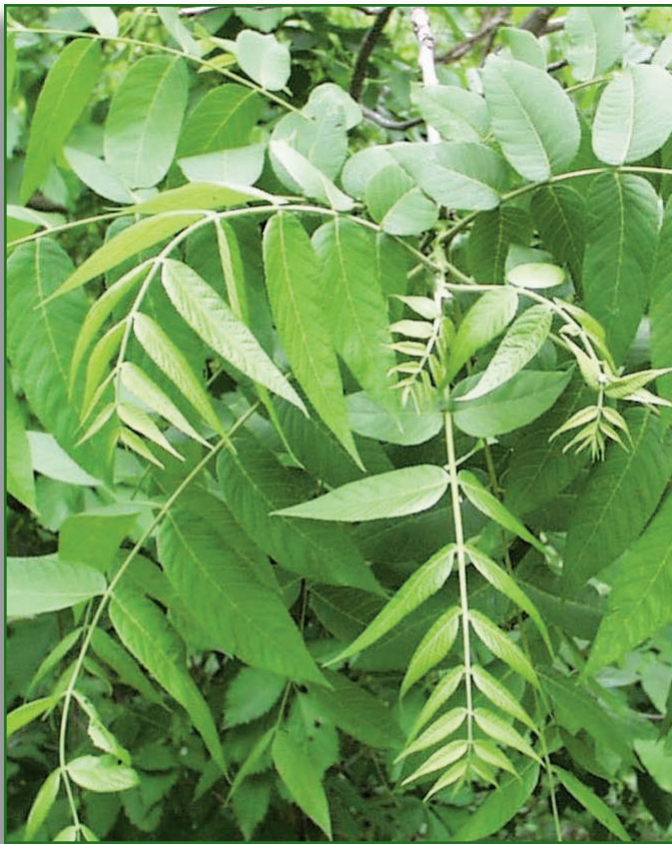
Black walnut leaves