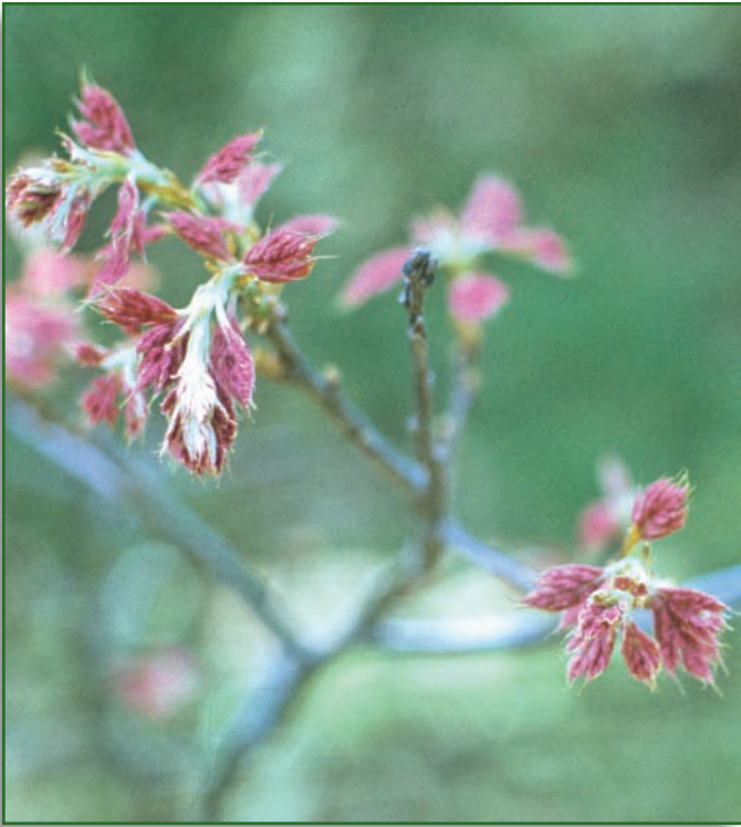
Newly emerging oak leaves or buds