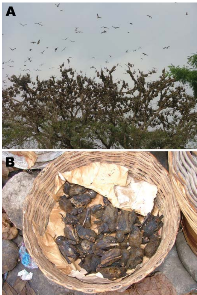
Figure 2. A) Density of a typical Eidolon helvum roost in the Accra colony. B) E. helvum as bushmeat in an Accra market.