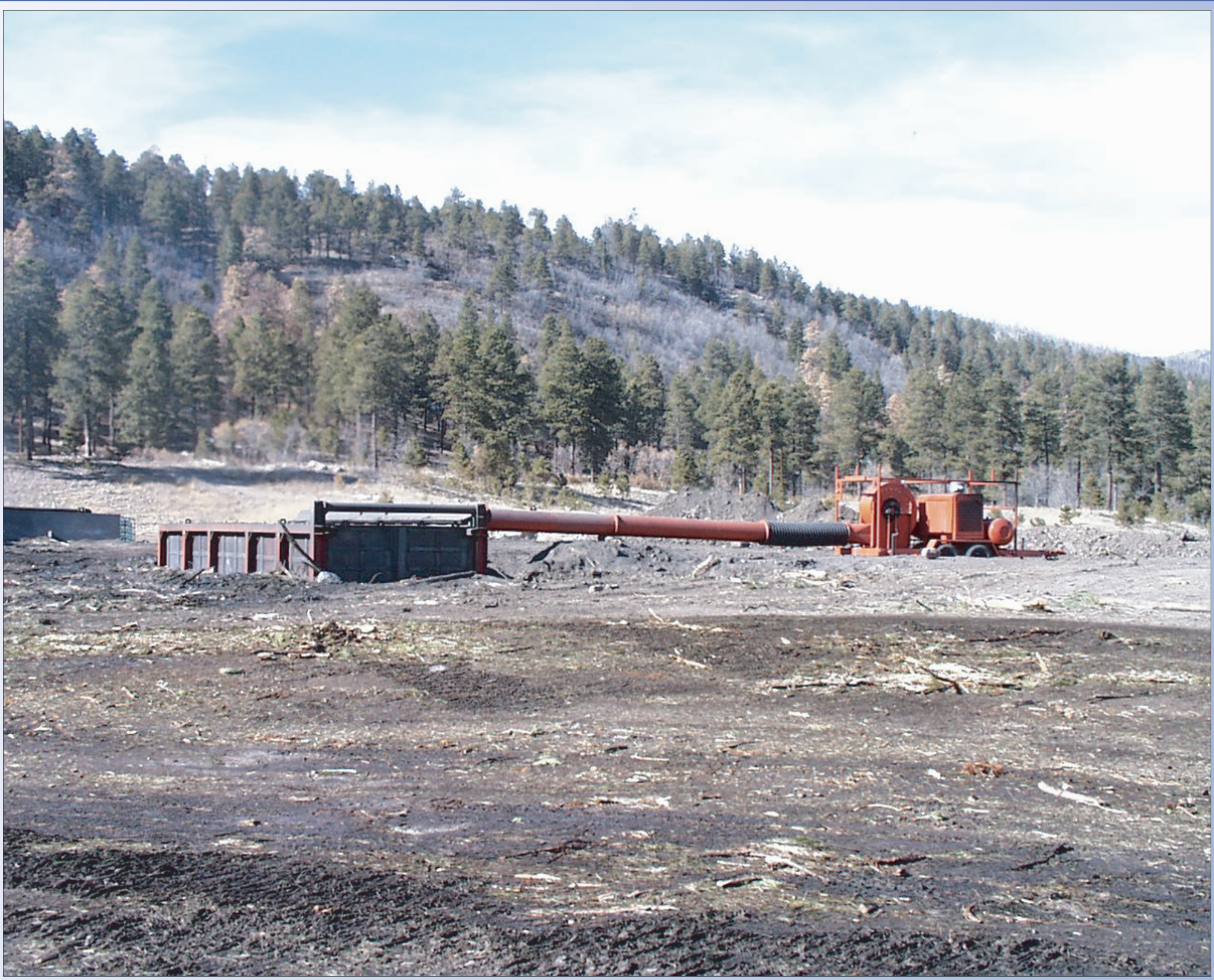
Air Curtain Destructors Trench