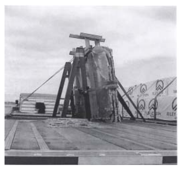
A-frame rack used to transport rock slabs