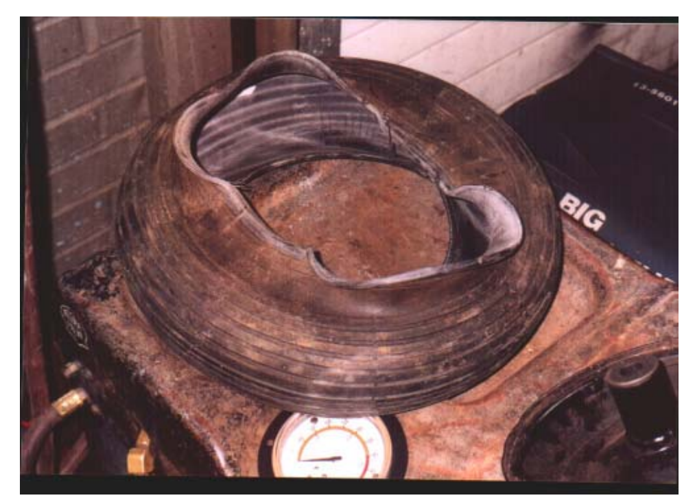
Picture depicting damage to tire that occurred during attempt to inflate a mismatched tire and rim