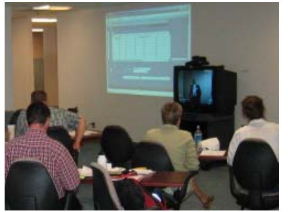
A group of agency representatives observed the CRP1 sessions remotely from the Twinbrook building in Maryland

Throughout August, UFMS module teams demonstrated the HHS requirements that the Oracle U.S. Federal Financial application inherently meets ("fits"). HHS agencies sent representatives to observe as each script was executed using sample CDCspecific data. The agency representatives were then given the opportunity to ask