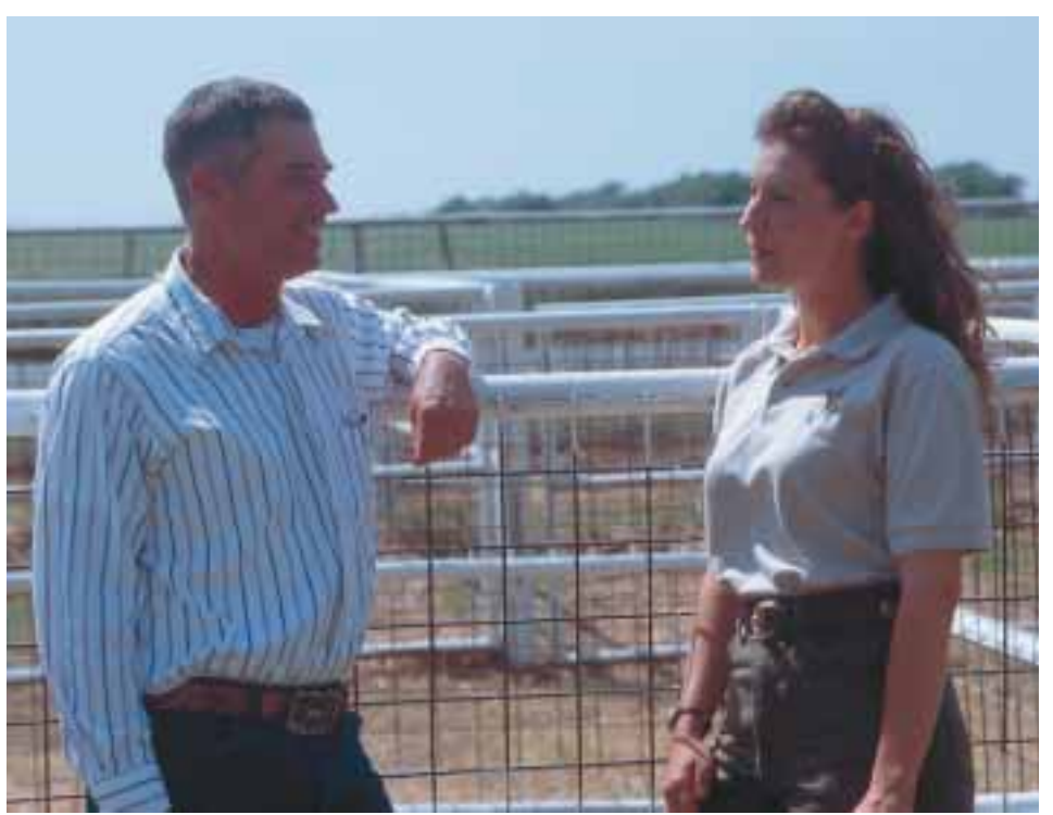
Service biologists work with landowners to conserve species on private lands.

Stewardship: the careful and responsible management of something entrusted to one's care.