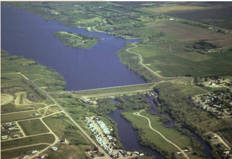
Jamestown Dam and Reservoir.

The Dakotas Area Office is responsible for administering Reclamation programs in North Dakota and South Dakota. The mission of the office is to provide technical assistance and leadership in the responsible development and management of water and related resources to enhance the quality of life in both states. Programs and projects conducted by the Dakotas Area Office are very diverse in nature. Many of the activities are associated with the planning, construction, and operation and maintenance of rural water systems. Other activities include operation and maintenance of Reclamation facilities, contract renewals, assistance with irrigation development, water management studies, and water conservation.