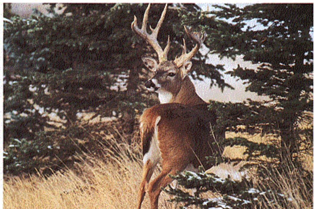
Numerous wildlife species use windbreaks as travel lanes, escape cover and shelter from bad weather. For more details on how to make your windbreak wildlife-friendly see EC 91-1771 Windbreaks and Wildlife.

the protected zone. The most common location for a single field windbreak is at the edge of the field. This is a good location if you farm on both sides of the windbreak, but it is not the most efficient location if the windward protection falls on non-crop ground. Locating the windbreak within the field at a distance of 2 to 5 H takes advantage of the windward protection and increases economic return. In most cases, a single windbreak will not protect the entire field and additional windbreaks, parallel to the first, will need to be established at intervals across the field. Typically, the distance between windbreaks should range from 10 to 20 H depending on the degree of protection desired and the size of farm equipment.