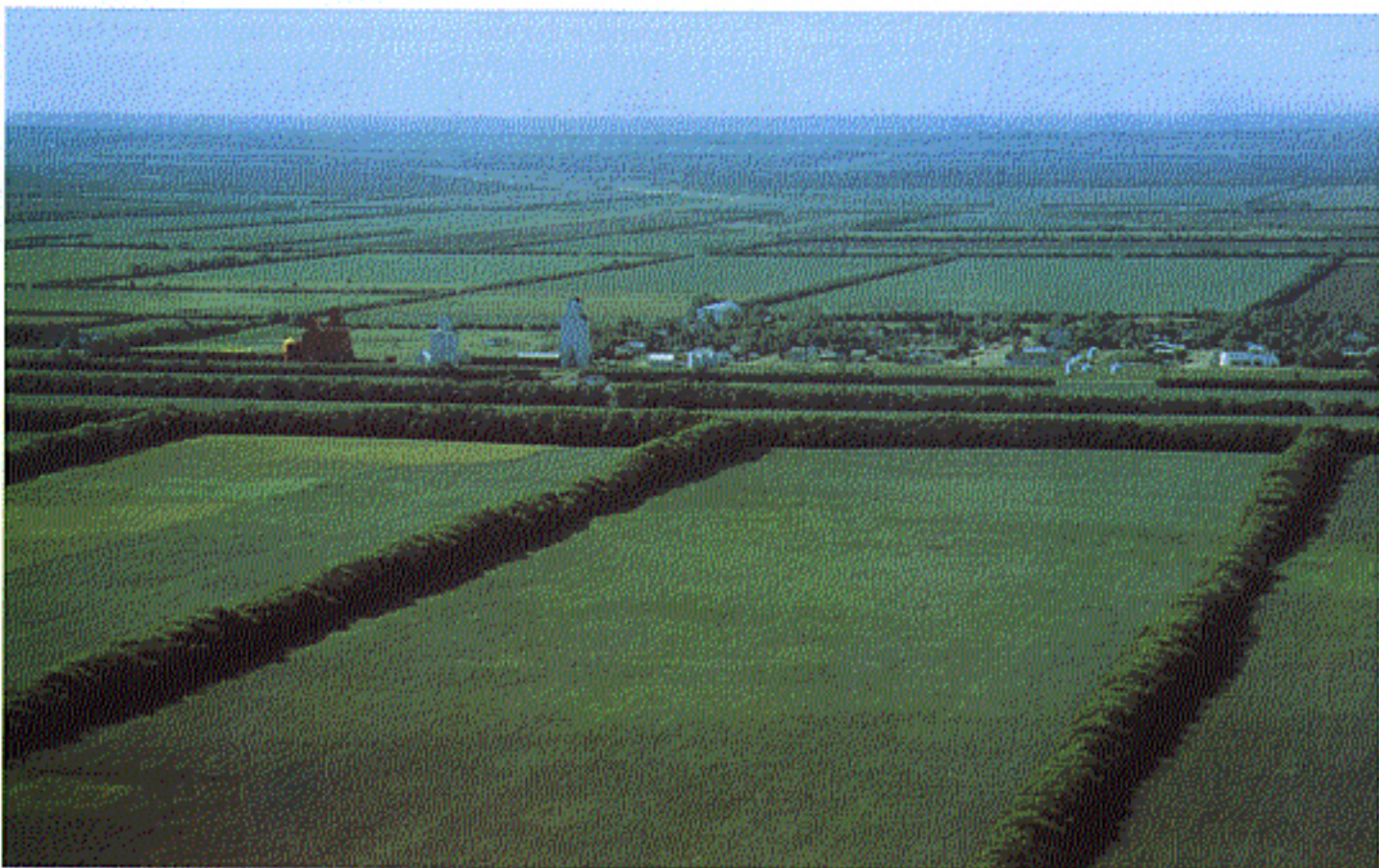
In many areas, problem winds come from several directions and complete protection of a field may require a system of windbreaks to achieve full protection.

Another important economic benefit of field windbreaks is the opportunity for a greater diversity in crop