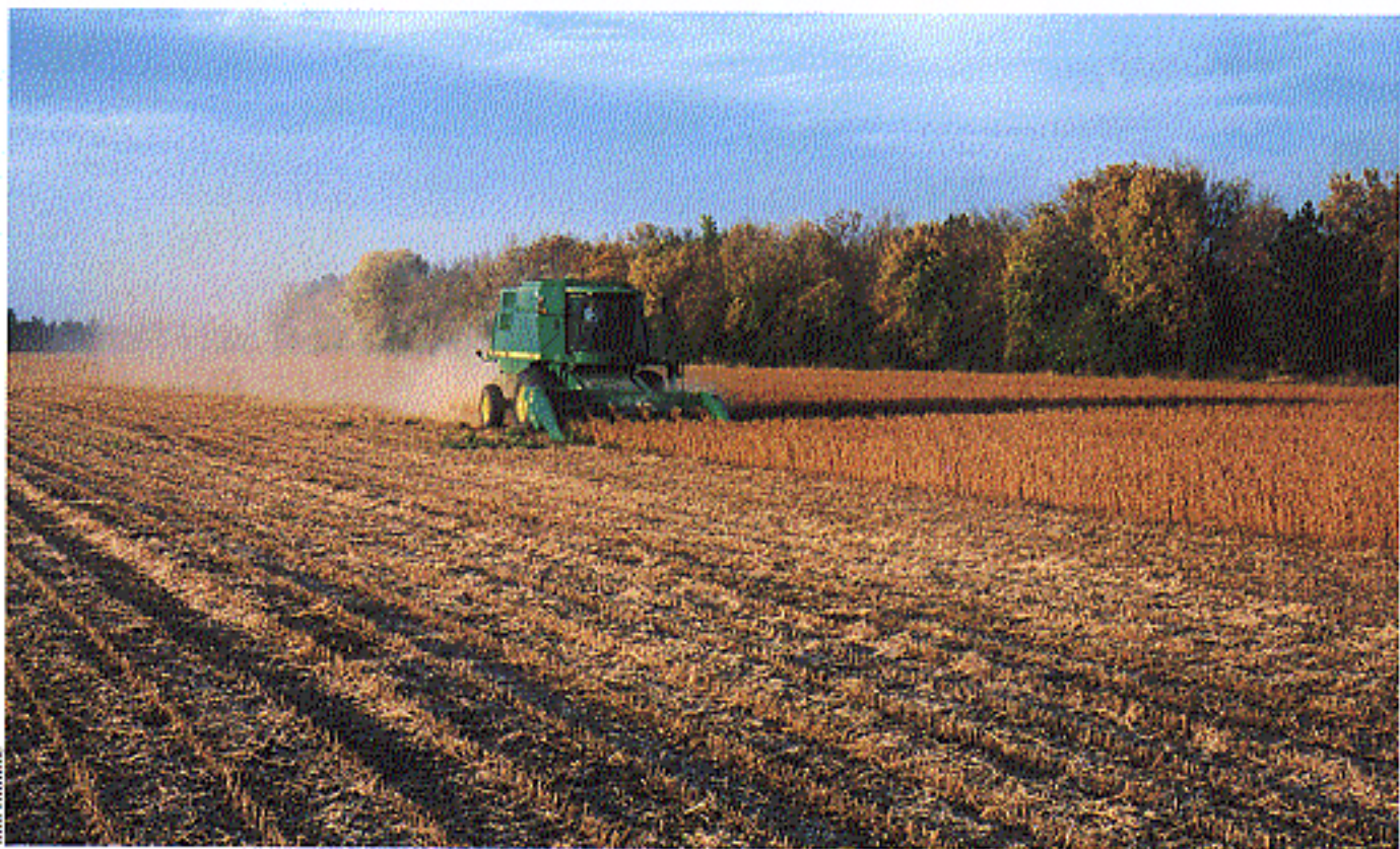
Soybean yields are increased 12 to 17 percent in fields protected by windbreaks. The two-row field windbreak in the background is composed of a mix of hardwoods and conifers and has a density of about 60 percent.

Field windbreaks provide positive economic returns to producers. For example, a 160-acre crop field can be totally protected within 20 years with four to six single-row field windbreaks spaced evenly across the field. These windbreaks will occupy about six acres and by the seventh year will begin to increase net yields and profits. In addition, field windbreaks provide opportunities to enhance natural controls of insects, provide valuable wildlife habitats, and add permanence and biological diversity to our agricultural systems.