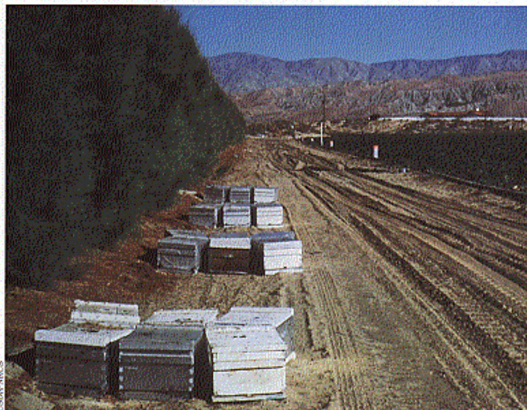
Windbreaks can provide favorable microclimate conditions for pollinating insects, increasing yields of many vegetable and fruit crops.

Wind erosion occurs primarily on large, open fields where the soil is loose, dry and finely granulated and where the soil surface is smooth and vegetative cover is sparse or absent. These conditions most often occur during the planting season when the soil has been prepared for planting. Conservation tillage systems help retain vegetative cover but may limit crop selection, especially on more erosive soils or for crops producing low amounts of residue. Conservation tillage systems may require the use of additional herbicides which may be either economically or environmentally undesirable.