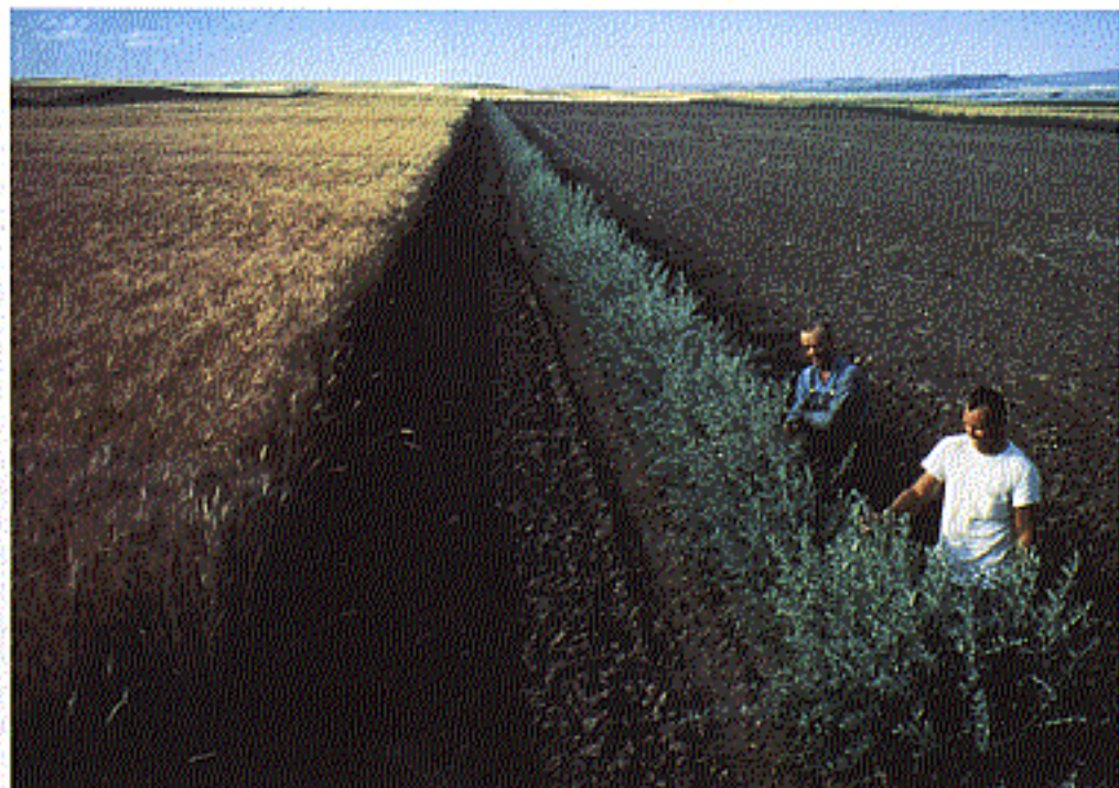
In arid areas where trees are difficult to grow, shrubs or tall native grasses may be used to provide crop protection, to control wind erosion, and to capture snow for crop production.