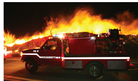
Firefighters work to control a wildfire near Springer, Okla., on Monday, January 16, 2006.

The USGS conducts vegetation and fuels mapping to support firefighting readiness, reduce wildfire hazards in the wildland-urban interface, and assess wildfire effects on ecosystems.