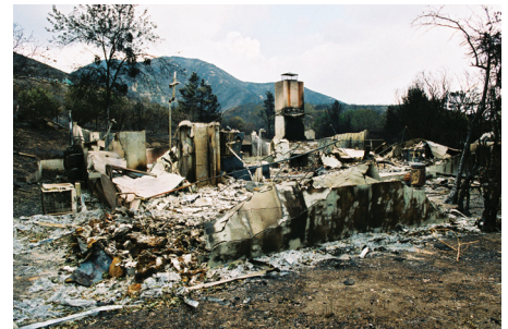
A wildfire left very little of this home near San Bernadino, Calif., in October 2003.