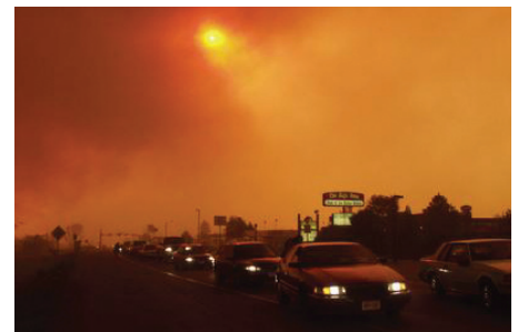
The evening sun barely penetrates smoke and ash as evacuees flee Glenwood Springs, Colo., because of spreading wildfires on Saturday, June 8, 2002.