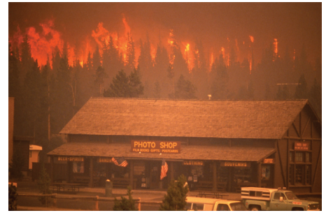
A wildfire in Yellowstone National Park, Wyo., approaches a gift shop and lodge on Wednesday, September 7, 1988.

USGS wildfire science is an integral part of the Federal Government mission to protect life, property, and natural resources before, during, and after wildfires.