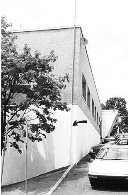
FIG. X1.8 Single Tall Vent Pipe (Arrow) for Underground Storage Tank on Side of Building