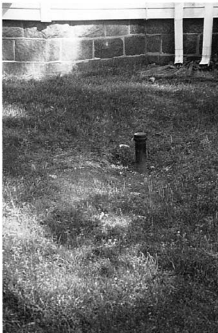
NOTE 1—Approximately 2½-in. (64-mm) diameter with screw cap. FIG. X1.9 Fill Pipe for Residential Underground Fuel Oil Storage Tank