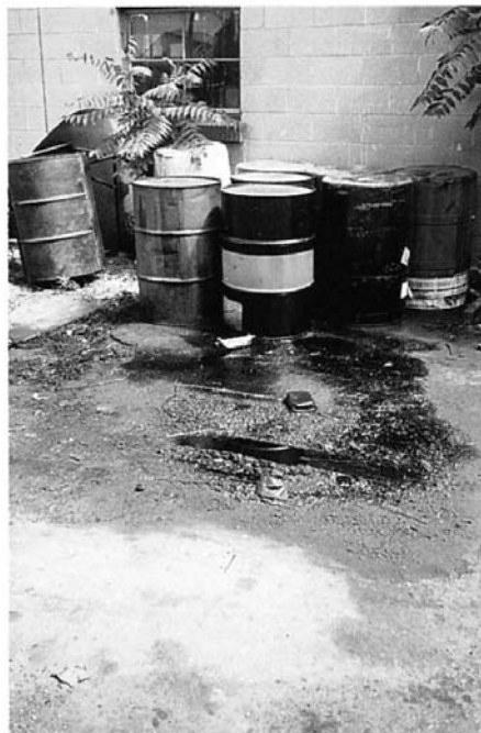
FIG. X1.12 Surface Staining from Improper Drum Storage

ASTM International takes no position respecting the validity of any patent rights asserted in connection with any item mentioned in this standard. Users of this standard are expressly advised that determination of the validity of any such patent rights, and the risk of infringement of such rights, are entirely their own responsibility.