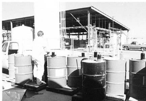
FIG. X1.1 Chemical Storage in 55-gal (208-L) Steel Drums