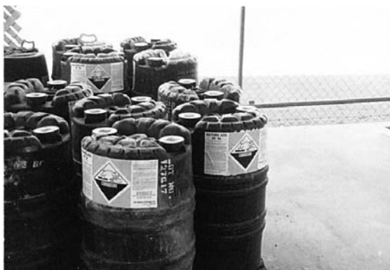
FIG. X1.2 Chemical Storage in 55-gal (208-L) Plastic Drums