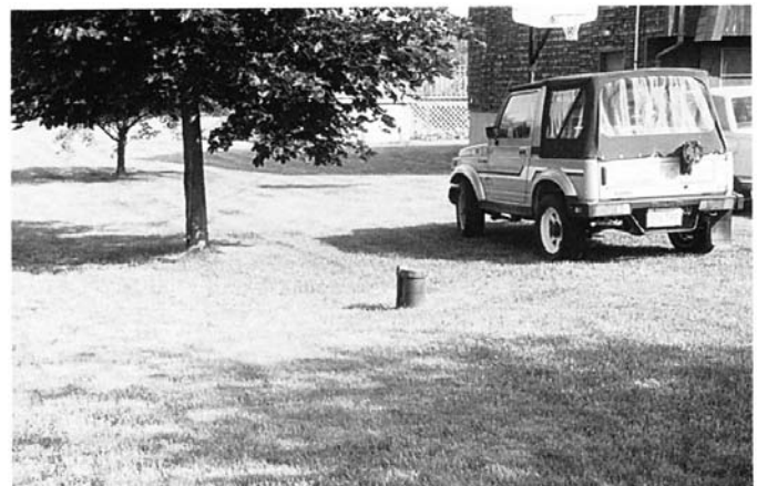
NOTE 1—Approximately 8-in. (203-mm) diameter FIG. X1.11 Water Supply Well for Residential Property