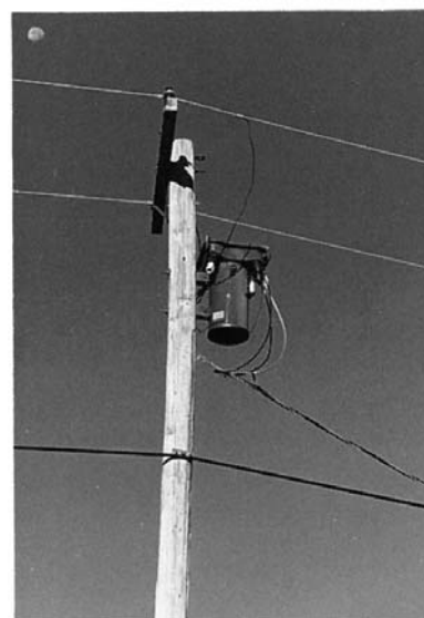
FIG. X1.3 Typical Pole-Mounted Transformer