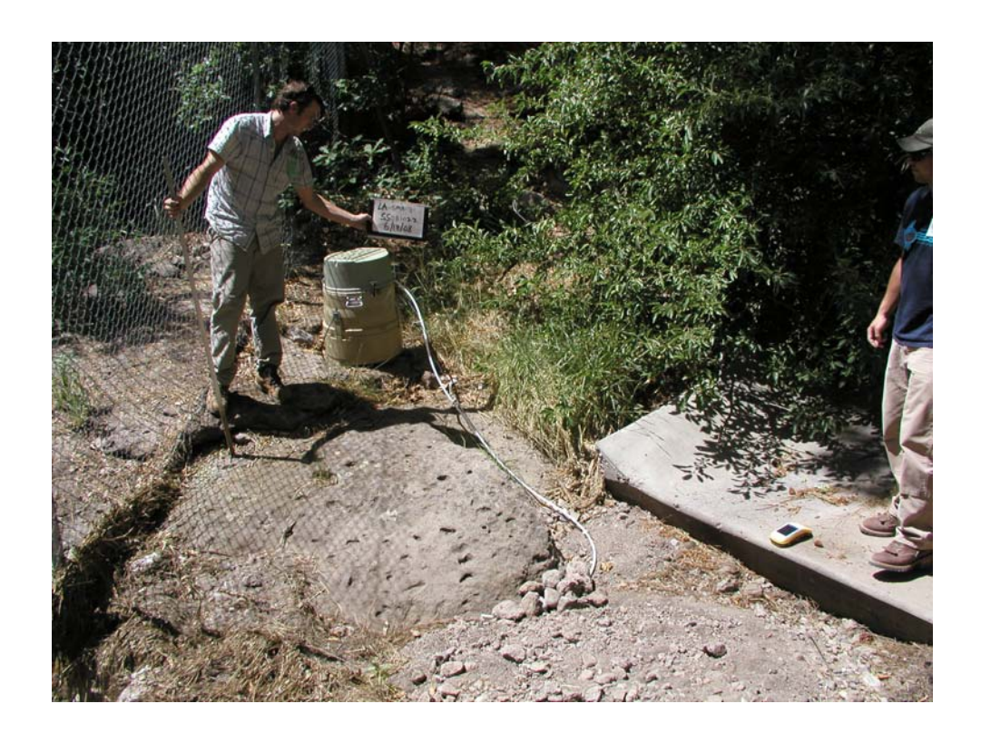
Figure 3.1-3 LA-SMA-2, the run-on sampler located at the upstream end of the tributary canyon and just upgradient of the SWMU