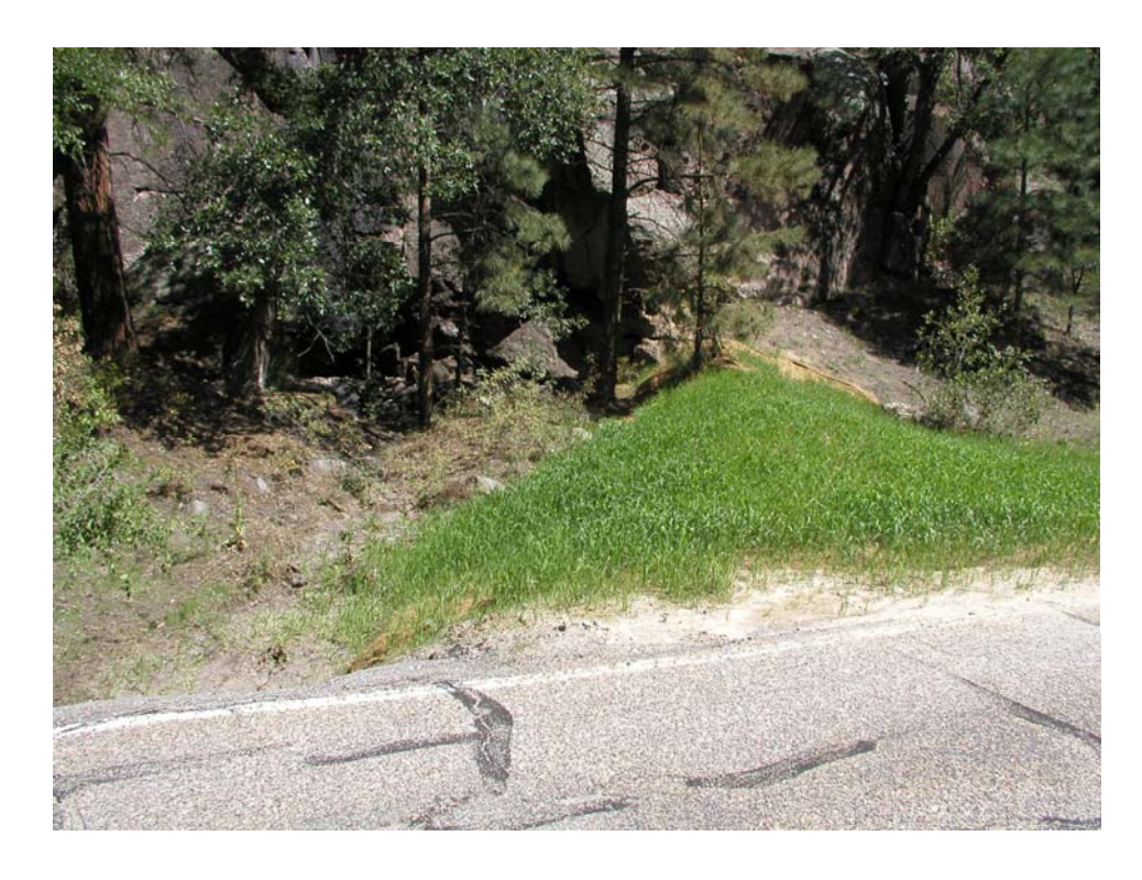
Figure 3.1-2 Earthen berm that routes stormwater under paved road through 18-in. culvert and away from LA-SMA-2 drainage