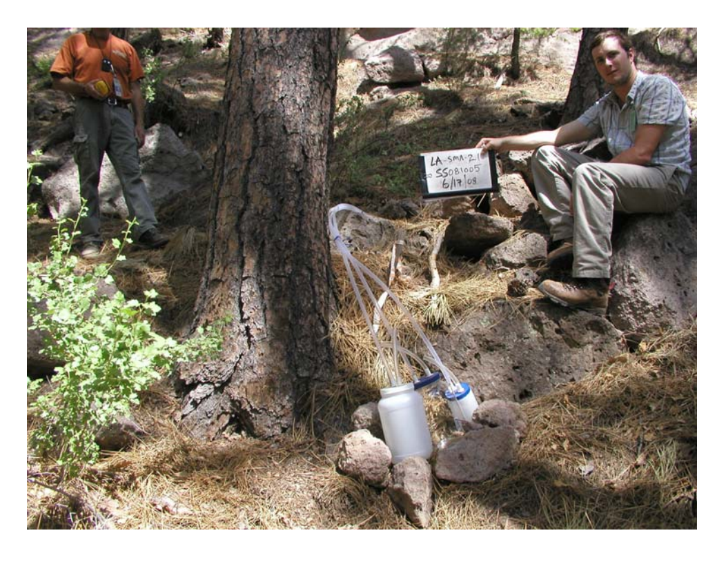
Figure 3.1-4 LA-SMA-2.1, the existing sampler at the outfall of SWMU 01-001(f)