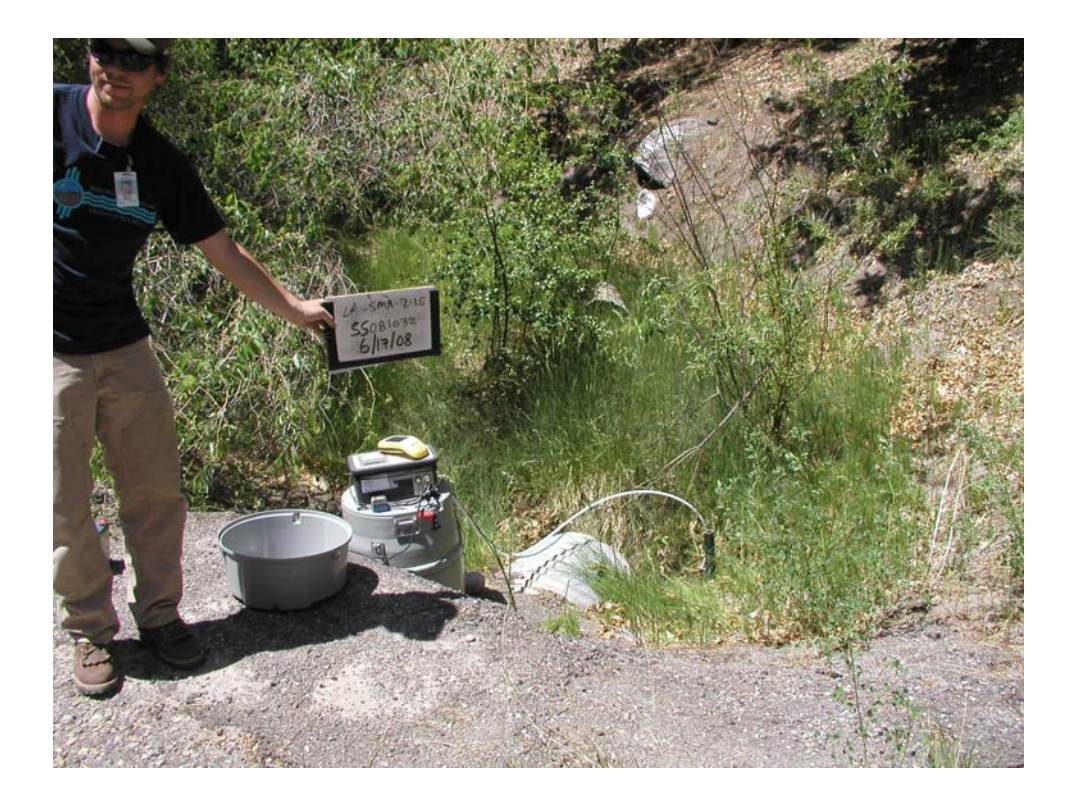
Figure 3.1-6 LA-SMA-2.15, just upstream of the existing 24-in.-diameter culvert at Omega Road