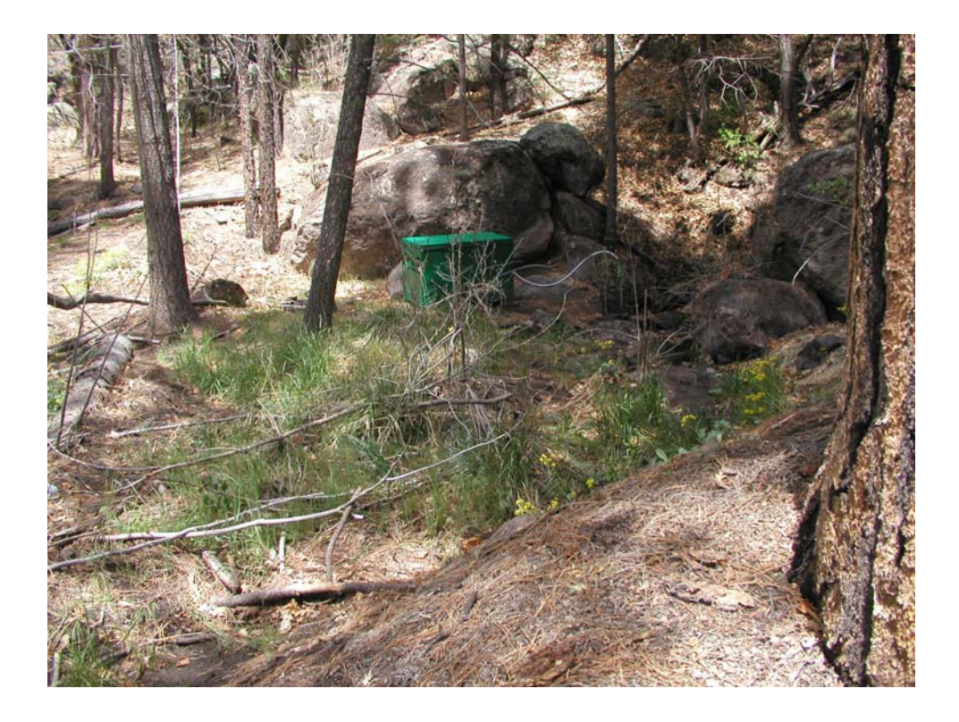
Figure 3.1-5 LA-SMA-2, the existing sampler location at the bottom of the SMA