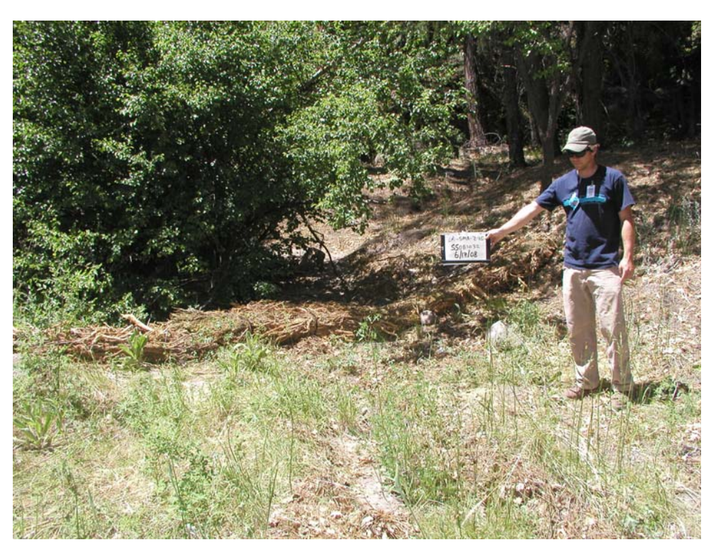
Figure 3.1-1 Example of juniper bales placed below LA-SMA-2 FFCA sampler and above the LA-SMA-2.15 sampler