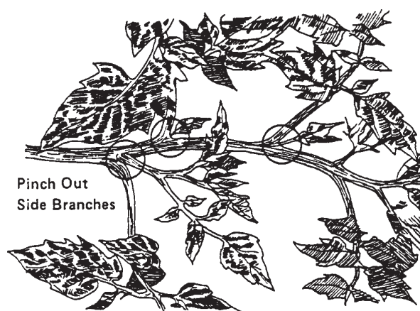
Fig. 2 Pinch out branches in axils.

develop, then remove any unwanted suckers, leaving only the terminals to grow. Use wooden stakes or a trellis, or use an overhead wire from which string or twine is tied loosely around the base of the plant. Tie two or three strings per plant, depending on how many branches you want. As the main terminals grow, untie the string from the suspended wire, wrap it around the stem for support, and retie it once again to the suspended wire.