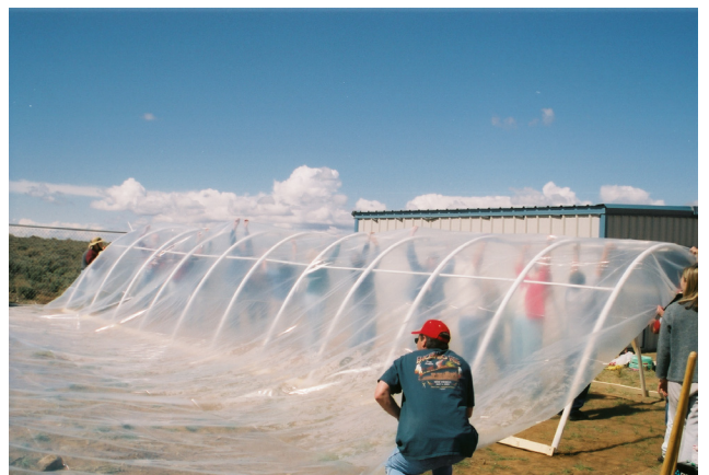
Figure 10. Covering the hoop house with 6-mil. plastic film.