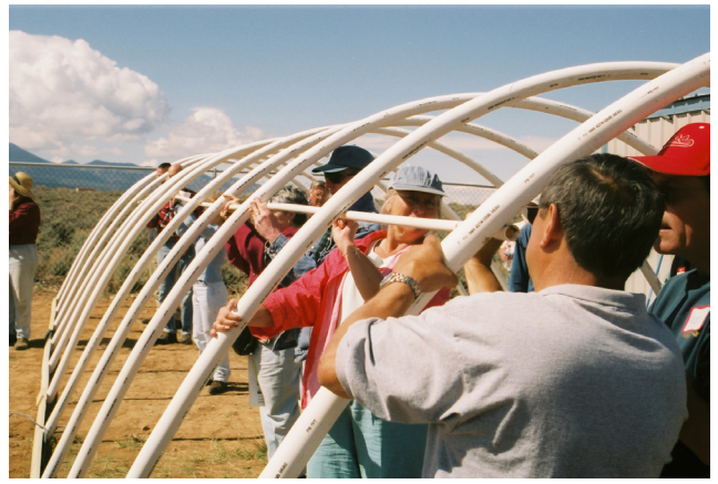
Figure 8. Attaching the 3/4-in. PVC pipe braces to the structure.