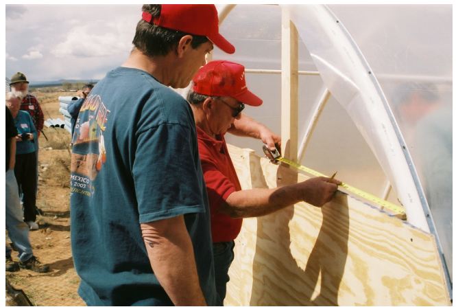
Figure 16. Making a window on the back end wall.