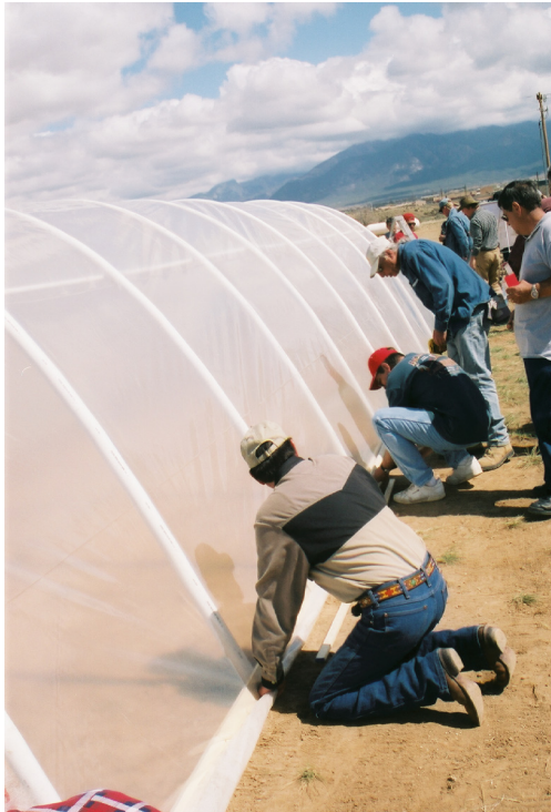
Figure 12. Attaching the plastic cover to the baseboards.