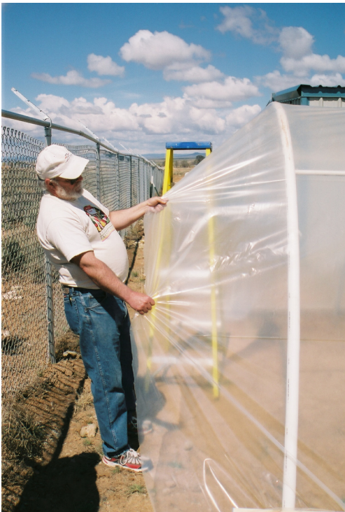
Figure 11. Stretching the plastic over the hoop house structure.