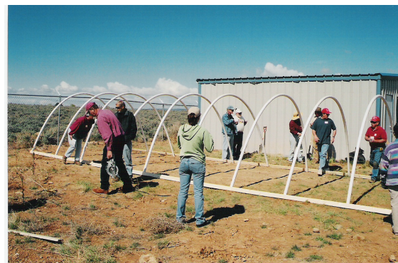
Figure 4. Attaching the baseboards to the bottom of the PVC pipes.