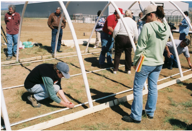
Figure 5. Laying out the tubular 3/4-in. braces.