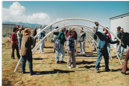
Figure 2. Bending the 2-in. x 20-ft. PVC pipe and setting them on 1/2-in. rebar stakes.