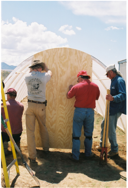
Figure 14. Attaching the front door to the hoop house.