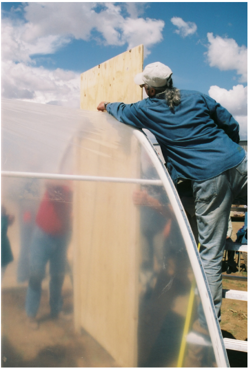
Figure 13. Marking the door to be cut.