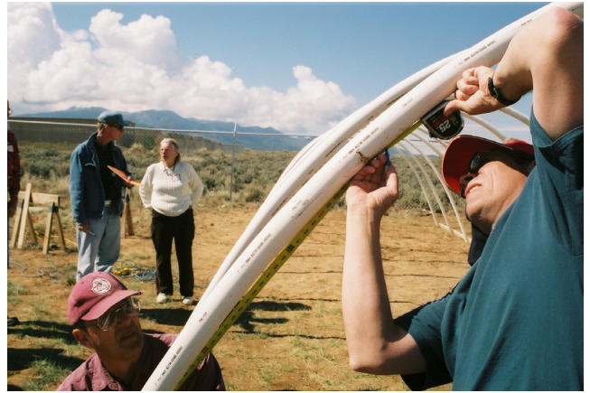
Figure 6. Marking the height where the braces will be attached.