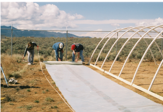
Figure 9. Rolling out the plastic to the appropriate length.