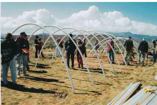
Figure 3. The hoop house structure takes shape.