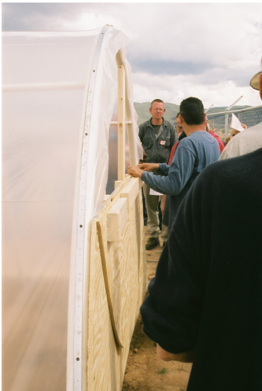
Figure 17. Window completed; hoop house completed.