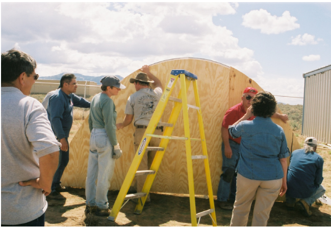
Figure 15. Finishing the front end wall of the hoop house.