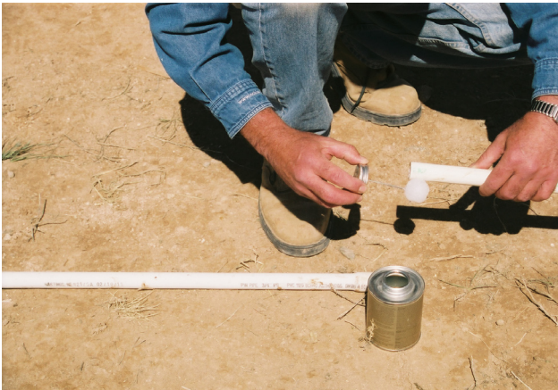
Figure 7. Gluing 3/4-in. pipe together to be used as braces.