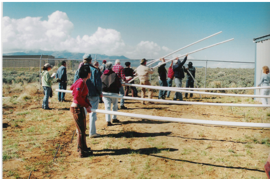
Figure 1. Laying out the 2-in. x 20-ft. PVC pipes that will be used for the frame.