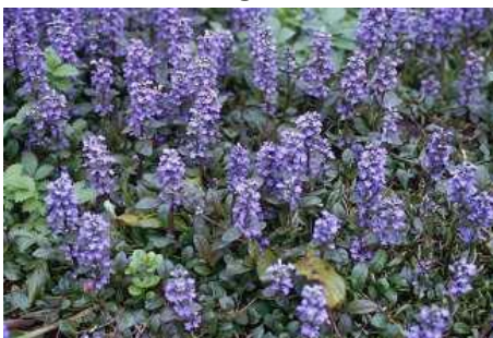
Common bugle ( Ajuga reptans L.) thick mat of groundcover