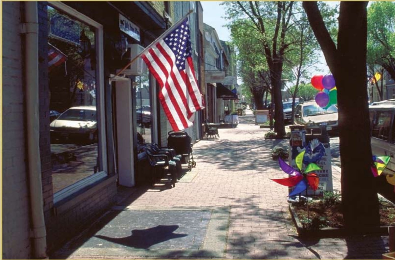
Florida / U.S. Virgin Islands

A guide to loans, grants, and technical assistance