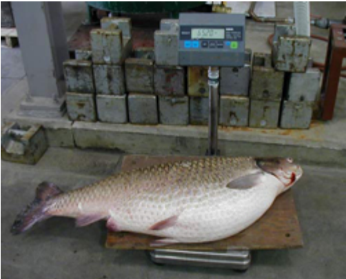
This 65 lb. 2 oz., 46.9-inch grass carp was landed by David Hughes of Indianapolis in a private lake in Morgan County. Hughes' record carp beat the previous Indiana grass carp record by nearly 24 lbs!

DESCRIPTION: The grass carp has an oblong body, a round belly and a broad head. Its color is a silvery dark grey above, the sides are lighter with a gold sheen, and the belly is whitish. The dorsal fin begins in front of the fish's pelvic fins. It has large scales that resemble a chain link fence. There are no teeth in the grass carp's jaw but it does have pharyngeal teeth. The maximum-recorded length of a grass carp is 5 feet and the maximum-recorded weight is 100 pounds. The largest grass carp caught by an Indiana angler weighed 65 pounds 2 ounces.