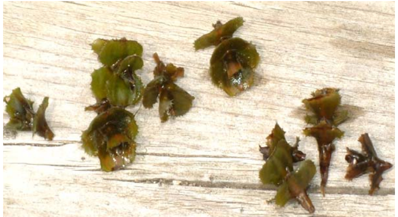
Curlyleaf turions

Hundreds of turions can be produced by each plant, and they can be dispersed by water currents. Turions are produced in the late spring, just before the plants begin to die. Turions remain dormant in the sediment through the summer until cooling water temperature triggers their germination in the fall. The germination rate of turions is very high, some estimates indicate between 60-80%. Plants will also grow from the rhizomes of past plants.