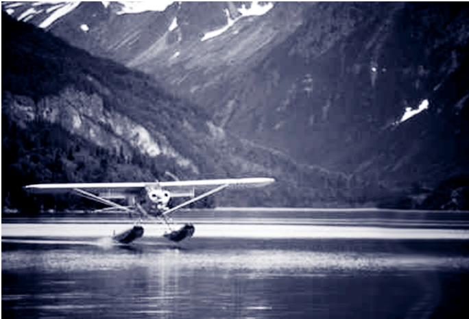
FIGURE 1. A floatplane typical of aircraft used in remote areas of Alaska