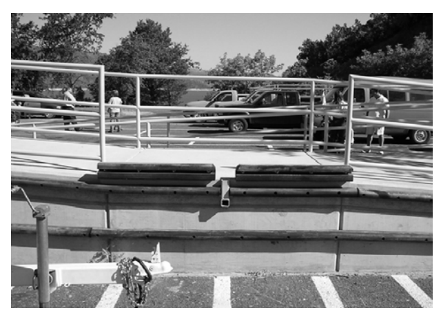
Patient lift receiver on accessible loading platforms.

For current information on public boat ramps at Shasta Lake, contact the Shasta Lake Information Center at (530) 275-1589. For Trinity Lake, contact the Weaverville Ranger Station at (530) 623-2121.