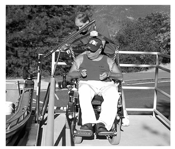
Accessible loading platform and slip for a patient lift at Centimudi public boat ramp at Shasta Lake.

The Antlers, Centimudi and Packers Bay public ramps are usually open all year, however they may be closed when the parking lots fill up or lake debris makes launching hazardous. Clark Springs public ramp is closed during the winter.