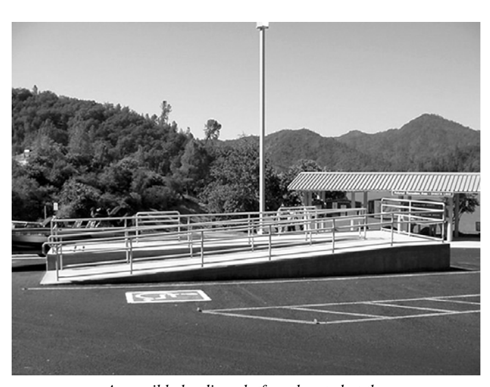
Accessible loading platform located at the Packers Bay public boat ramp at Shasta Lake.

If you would like to use one of these loading platforms at Shasta Lake, they are located at the Antlers, Centimudi and Packers Bay public ramps. At Trinity Lake, there is an accessible loading platform at the Clark Springs public ramp.