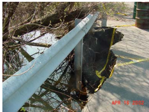
Parking lot before