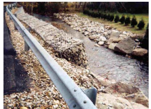
Parking lot after

The U.S. Department of Agriculture (USDA) prohibits discrimination in all its programs and activities on the basis of race, color, national origin, sex, religion, age, disability, political beliefs, sexual orientation, or marital or family status. (Not all prohibited bases apply to all programs.) Persons with disabilities who require alternative means for communication of program information (Braille, large print, audiotape, etc.) should contact USDA's TARGET Center at (202) 720-2600 (voice and TDD).