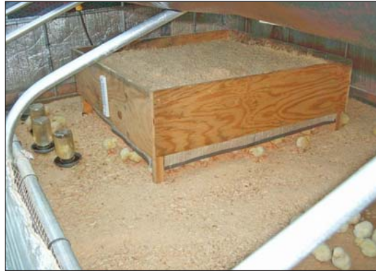
A hover used in a field pen.