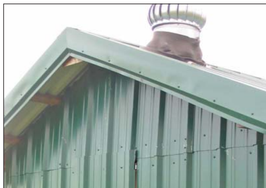
This small mobile house has an air inlet in the end wall and a “whirly-bird” vent on the roof to allow air and moisture to escape.