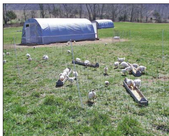
Alternative poultry production usually includes outdoor access.