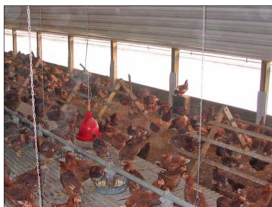
The indoor area is just as important as the outdoor area in free-range poultry production.

While access to the outdoors is an important feature of many alternative or free-range production systems, the indoor environment and management are also crucial. Poultry need access to an appropriate indoor environment for good production and welfare. Ideally, poultry should choose an environment; whether to be indoors or outdoors. Attention to ventilation, temperature, lighting, and litter conditions is needed. Additional good management practices include rodent control with a minimum of toxic materials. Alternative poultry production is often on a small scale, with portable houses. Production may be certified organic. Special practices may be needed compared to conventional poultry production. Alternative poultry production is a way to boost farm income and add fertility or diversity to a farm, while providing specialty poultry products to consumers as a part of sustainable agriculture.