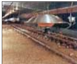
Large propane heaters/brooders.