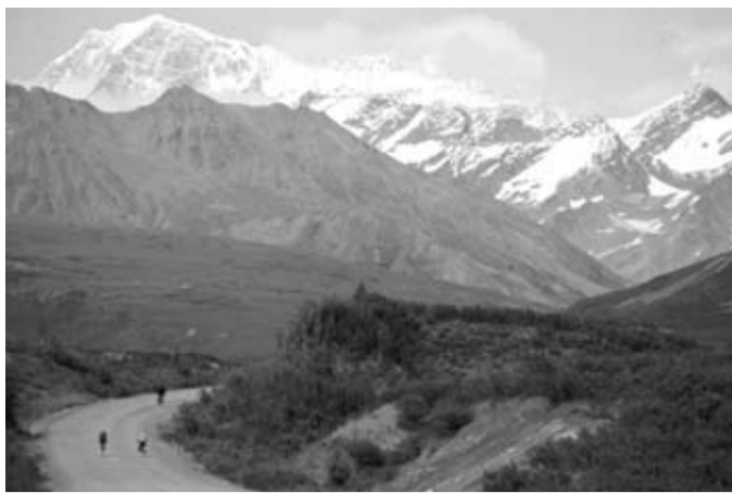
Alaska Range towers above cyclists between Paxson and Tangle Lakes.

You are driving on an esker, a sinuous ridge of silt, sand, gravel and cobbles that were carried and deposited by a stream that flowed within the