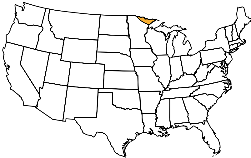
Gray Wolf Range at Time of ESA Listing