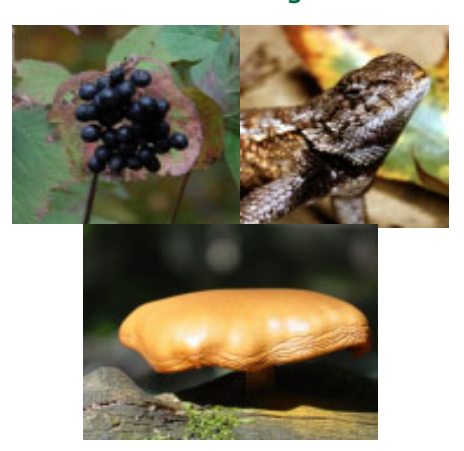
Tuesday March 11, 2008 8:45 am - 3:30 pm

A conference for natural resource professionals and land managers