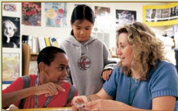
NSF supports innovative and stimulating education initiatives from pre-kindergarten to postdoctoral levels.