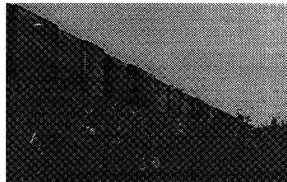
Figure 2–Computer-generated back side view of a wood sound barrier.