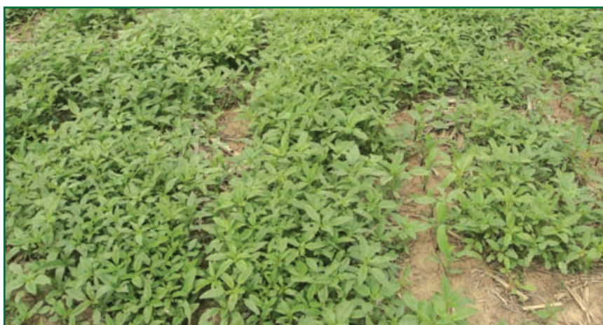
Figure 4. Waterhemp gains a competitive advantage over other plants because of high densities.

Although several summer annual weeds are more competitive on a plant-for-plant basis, waterhemp gains a competitive advantage through the sheer number of plants infesting an area (Figure 4). Seasonlong competition by waterhemp (more than 20 plants per square foot) reduced soybean yields 44% in 30-inch rows and 37% in 7.5-inch rows (Steckel and Sprague, 2004b). Waterhemp that emerged as late as the V5 soybean growth stage reduced yields up to 10%.