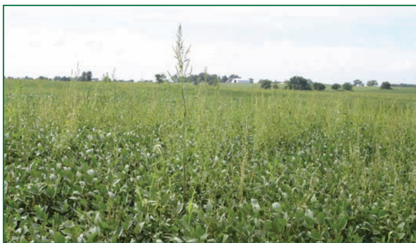
Figure 5. The waterhemp plants shown here developed three-way multiple herbicide resistance — to glyphosate, ALS-, and PPO-inhibitors.

Waterhemp was among the first U.S. weeds identified with multiple herbicide resistance. In 1998, a waterhemp population was confirmed resistant to ALS- and PSII-inhibiting herbicides (atrazine, etc.). More recently, waterhemp garnered the distinction of being the first U.S. weed to develop three-way multiple resistance — these combinations include resistance to ALS-, PSII-, and PPO-inhibiting herbicides; and glyphosate, ALS-, and PPO-inhibiting herbicides (Figure 5).