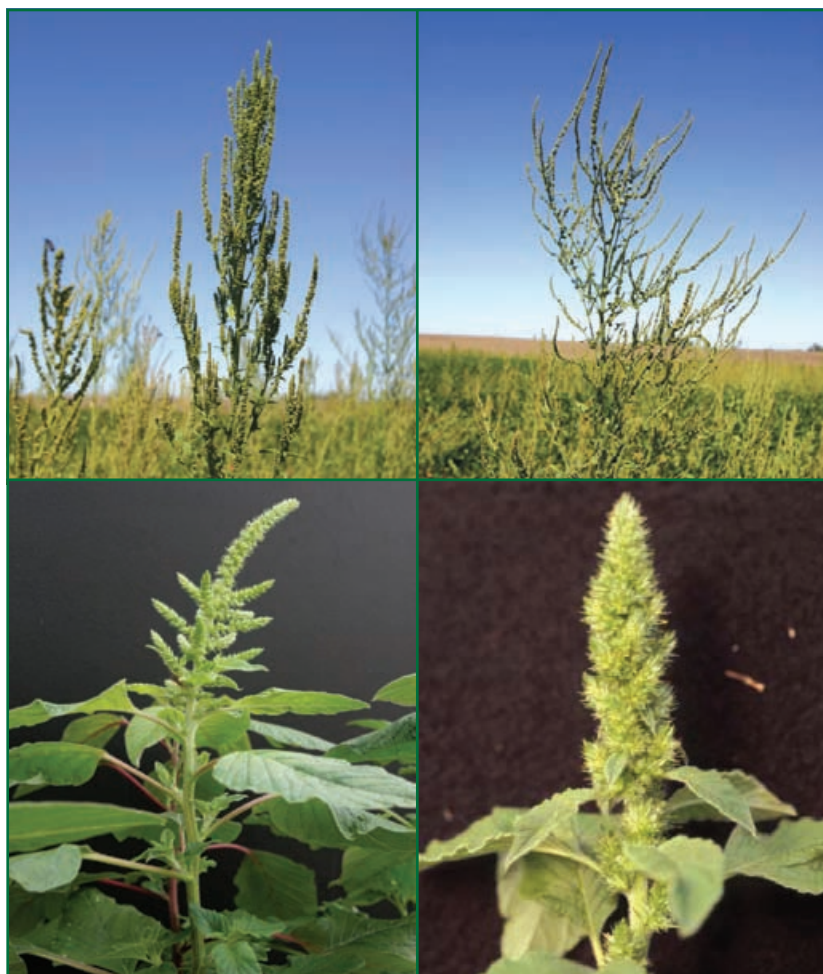
Figure 2. (Clockwise from top left) The seedheads of male waterhemp, female waterhemp, redroot pigweed, and smooth pigweed.

Palmer amaranth also is dioecious; whereas redroot and smooth pigweeds are monoecious (that is, the same plant has male and female flowers). Redroot and smooth pigweeds have denser, more compact seedheads than waterhemp, and Palmer amaranth has long, mostly unbranched, prickly seedheads (Figure 2).