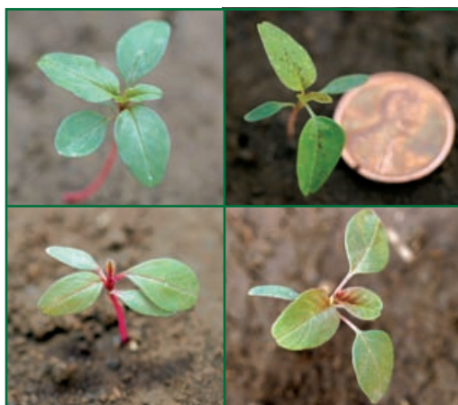
Figure 1. (Clockwise from top left) Seedlings of waterhemp, Palmer amaranth, redroot pigweed, and smooth pigweed.