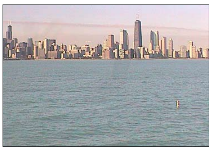
WebCam photograph of the Chicago skyline from the Chicago Met Station.

The Met Stations provide vital weather data that scientists incorporate within complex computer models used to produce nowcasts and forecasts of waves and circulation available on the Great Lakes Coastal Forecasting System (http://superior.eng.ohio-state.edu/). Observations from these stations are also provided to the National Weather Service (NWS) marine forecast offices at Milwaukee, Chicago, and Grand Rapids in real-time. Fishers, boaters, surfers, and other recreational users have found the real-time conditions and WebCam images particularly useful in making plans for when and where to venture out on the waters.