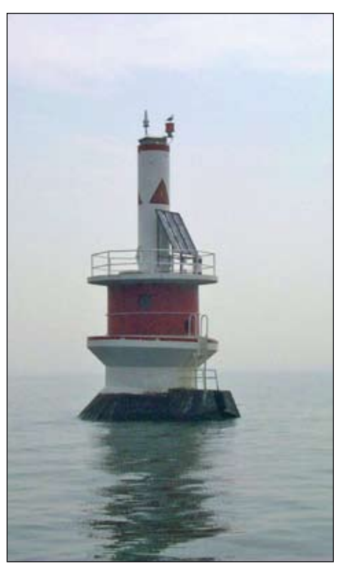
Toledo Meteorological station located at the end of the Toledo shipping channel in the middlle of the western basin of Lake Erie.