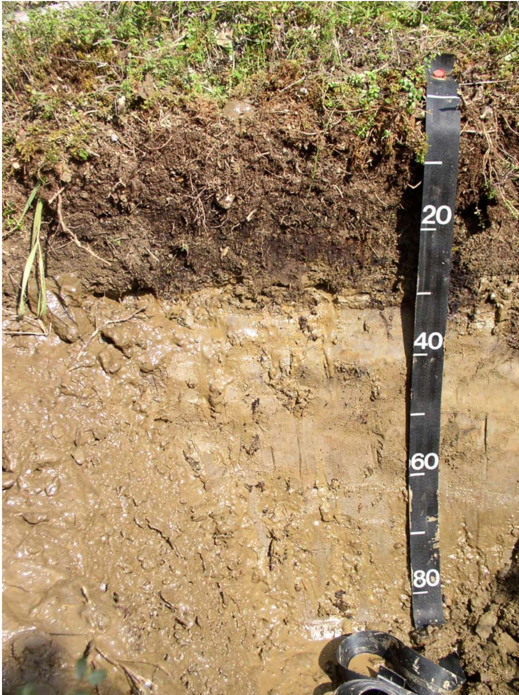
Figure 7. An example of a Turbel. Profile of Windy Creek coarse-silty, mixed, active, subgelic Typic Histoturbels. Windy Creek soils have moderately deep mixed loess and alluvium over permafrost.