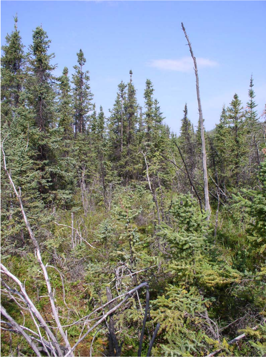
Figure 4. Typical landscape for Windy Creek soils. These soils occur on alluvial fans and terraces. Vegetation is stunted black spruce ( P. mariana ) forest with an understory of mixed shrubs that include Labrador tea ( L. groenlandicum ), blueberry ( Vaccinium uliginosum ), lingonberry ( vaccinium vitis-idea ) and various willows ( Salix spp. ) with a thick ground cover of peat mosses ( sphagnum spp. ).