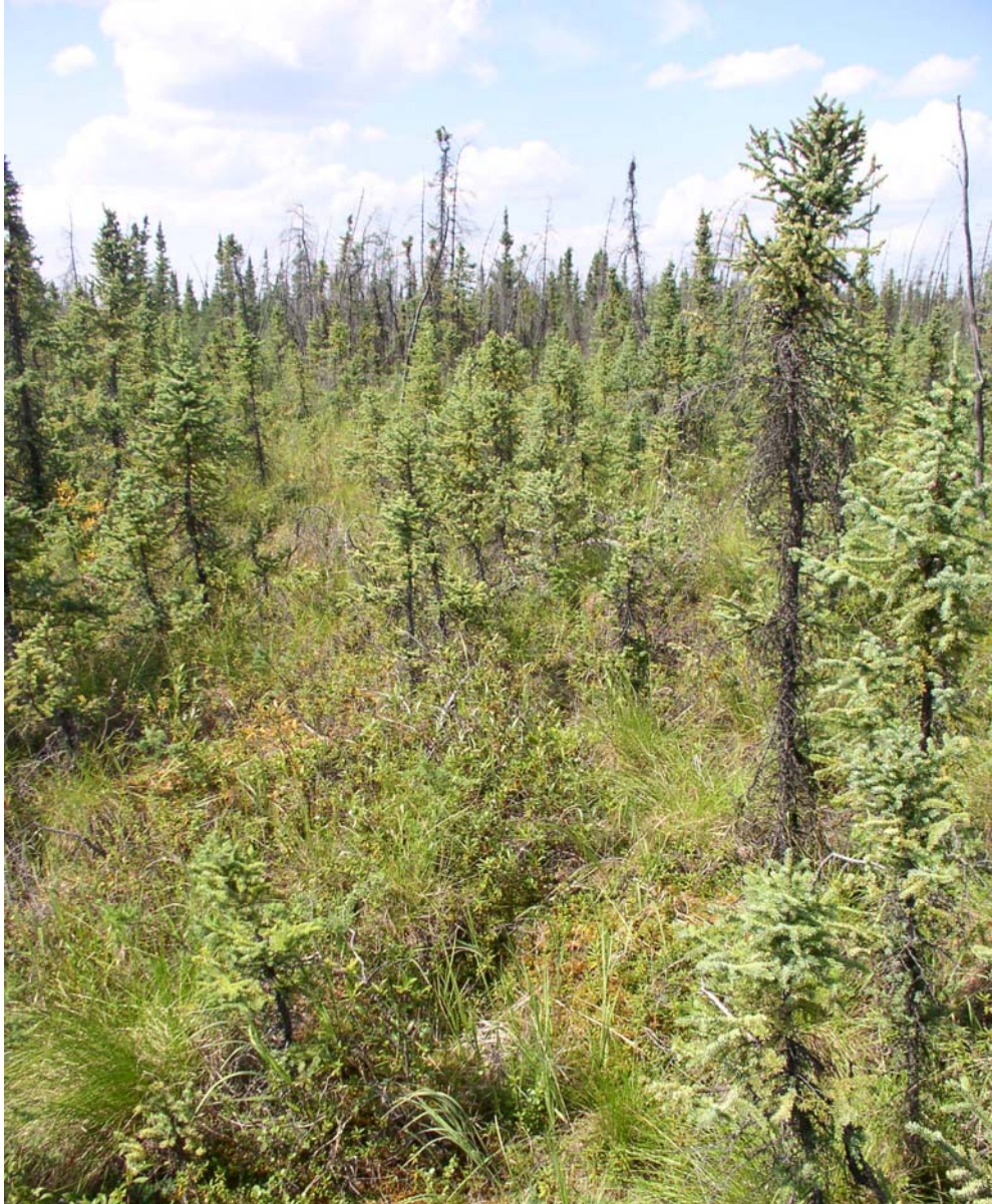
Figure 3. Typical landscape for Totatlanika soils. These soils occur on flood plains. Vegetation is stunted black spruce ( P. mariana ) forest with an understory of mixed shrubs that include labrador tea ( L. groenlandicum ), blueberry ( Vaccinium uliginosum ), lingonberry ( vaccinium vitis-idea ) and various willows ( Salix spp. ) with a thick ground cover of peat mosses ( sphagnum spp. ) and tussock forming sedges ( Eriophorum spp. ).

Terric Cryohemists and similar soils: 5 to 15 percent of the map unit