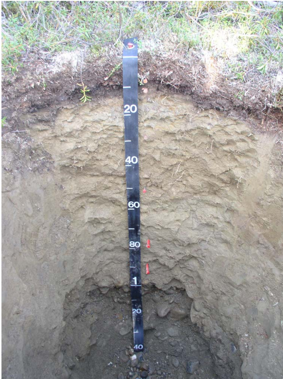
Figure 5. An example of a Haplocrypts. Profile of Sawmill Creek coarse-loamy over sandy or sandy-skeletal, mixed, superactive Typic Haplocrypts. Sawmill Creek soils have moderately deep mixed loess and alluvium over outwash or till.

2C horizons: (where present) Weathered bedrock of schist, conglomerate and/or greywacke