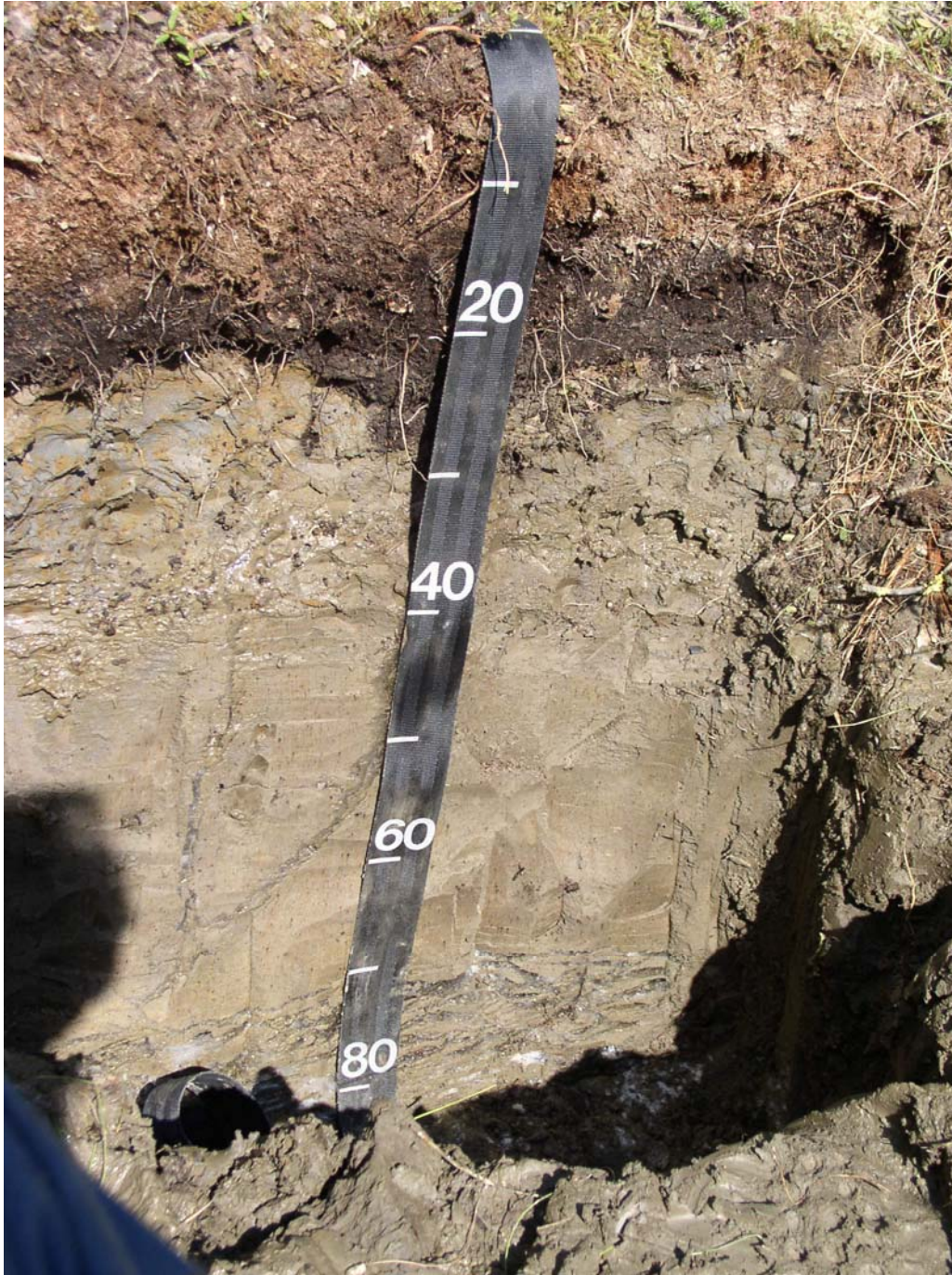
Figure 6. An example of a Turbel. Profile of Totatlanika fine-silty, mixed, active, subgelic Typic Histoturbels. Totatlanika soils have moderately deep mixed alluvium over permafrost. Segregated ice seen in this photo starting around 70 cm are common in these soils.