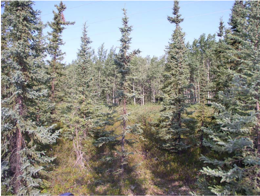
Figure 2. Typical landscape for Sawmill Creek soils. These soils occur on alluvial fans and terraces. Vegetation is black spruce ( Picea mariana ) forest with an understory of mixed shrubs that include labrador tea ( Ledum groenlandicum ), prickly rose ( Rosa acicularis ), and various willows ( Salix spp.).