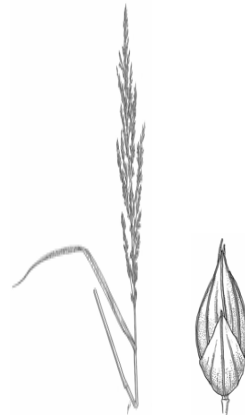
Inflorescence and floret