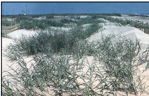
Stabilization of newly created sand dune

Fourchon originated from a native stand of bitter panicum found growing on a coastal beach in Lafourche Parish, Louisiana. It was selected for its vigorous growth, persistence after storm events, and performance in stabilizing dunes enhanced or created with sand fencing structures.