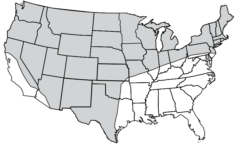
Historic Gray Wolf Range

Gray wolves once lived in much of the contiguous United States. They were only absent from a portion of California, the southwest corner of Arizona and from the red wolf range in the southeastern United States. By 1974, when gray wolves were listed as an endangered species, their breeding range had been reduced to a small corner of northeastern Minnesota and Isle Royale, Michigan. Individual wolves were periodically observed in the West, but there were no breeding packs. Recovery efforts have since restored the wolf to many areas of its historic range, including portions of the Southwest, the Rocky Mountains, and the western Great Lakes Region.