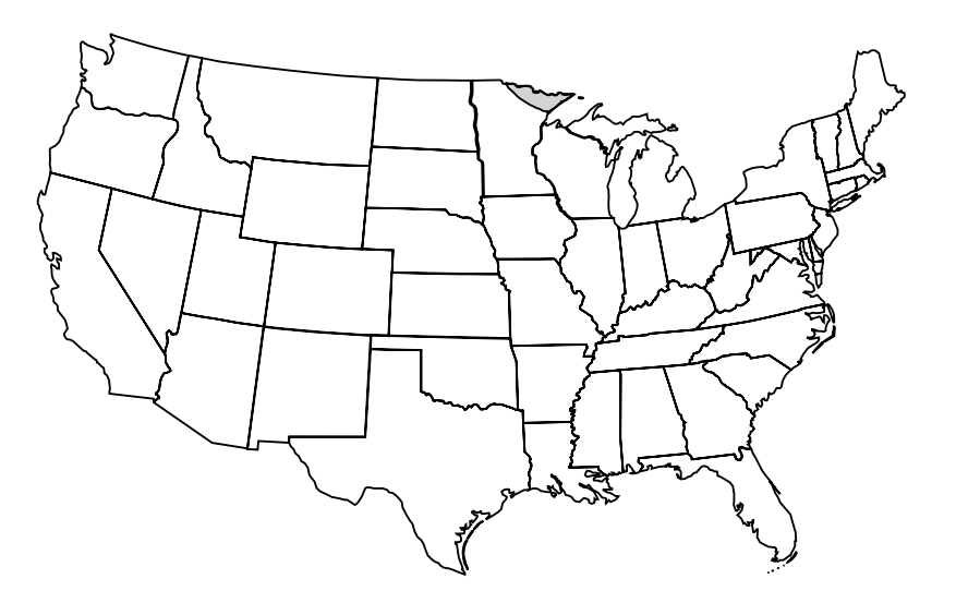
Gray Wolf Range at Time of ESA Listing