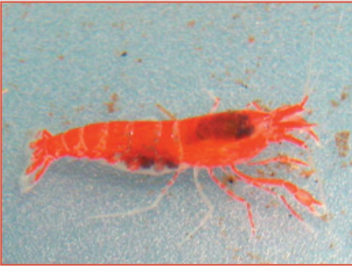
Figure 3. A native predatory shrimp, Metabetaeus lohena .