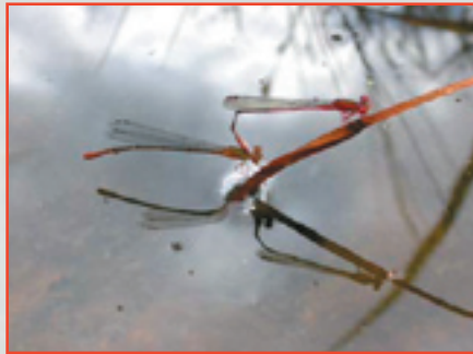
Figure 4. A mated pair of orange-black damselflies perch above a pool at Kaloko-Honokohau National Historical Park.