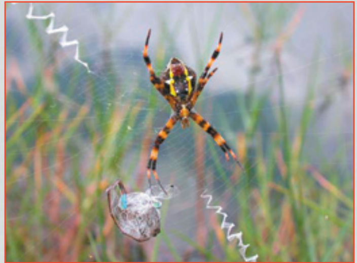
Figure 6. An invasive orb-weaver spider ( Argiope appensa ) with damselfly prey wrapped in its web at the edge of a pool.

In addition to habitat loss due to coastal development, anchialine pools are also threatened by invasive species (Fig. 5). Alien invertebrates, such as ants and spiders, pose a serious threat to anchialine pool biota. Ants are dominant predators within pool complexes, preying on native insects perched on poolside vegetation, and consuming native shrimp when pool waters recede during low tides. Invasive orb-weaver spiders construct webs across and around pools, catching native insects (Fig. 6). These spiders are extremely prolific around some pool complexes, and while impacts are not well documented, they are suspected to have significant impacts on native insect populations.