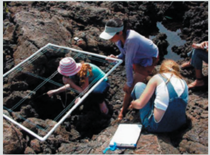
Figure 5. USGS technician surveys for alien invertebrates with assistance from local high school students.