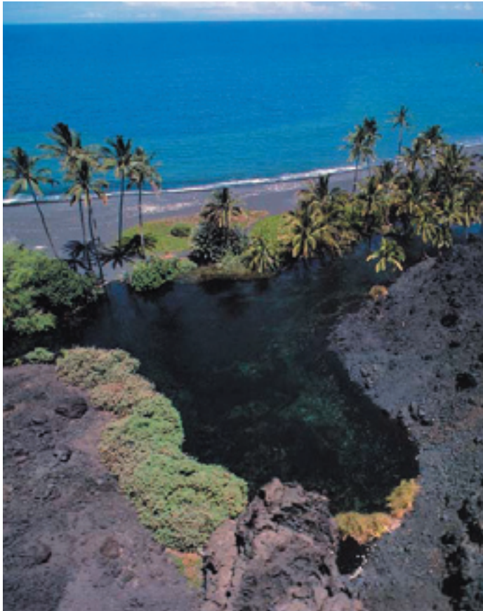
Figure 1. A large anchialine pool set back from the ocean along the Kona Coast: a place where fresh groundwater mixes with saltwater.