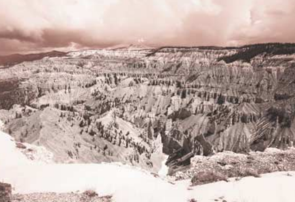
The basin states' proposal includes the potential development of a cloud seeding program to increase snowpack in the Upper Colorado River Basin.

much water could be banked and how much could be withdrawn as modeled for the different alternatives. The EIS will be “programmatically” in nature; any specific project to store water in Lake Mead will need its own, specific environmental compliance.