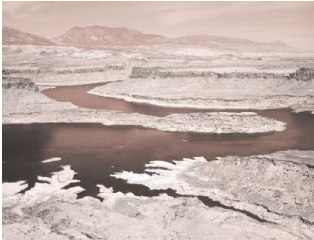
The prolonged drought has caused a major decline in storage in Lake Powell.

Under the no-action alternative, the secretary would continue to develop an Annual Operating Plan that would